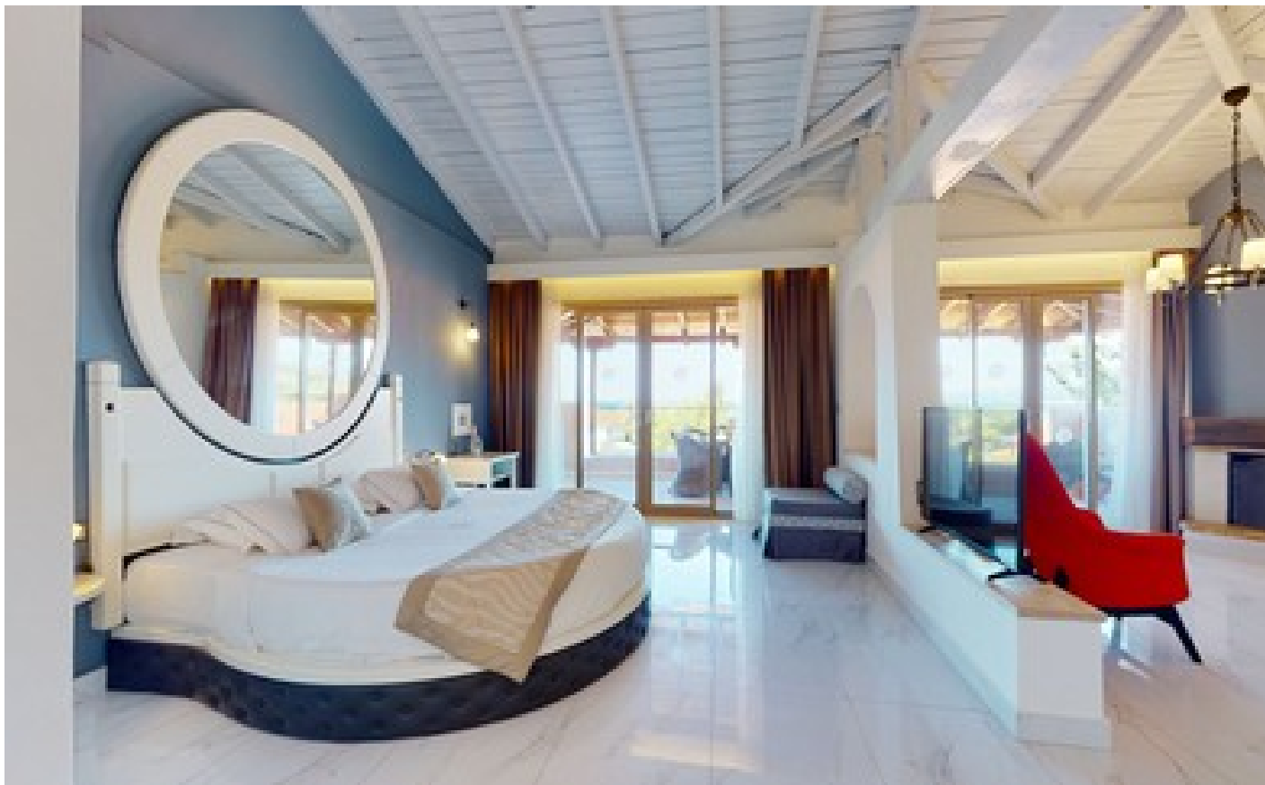
Executive Suite Patriko Sea View