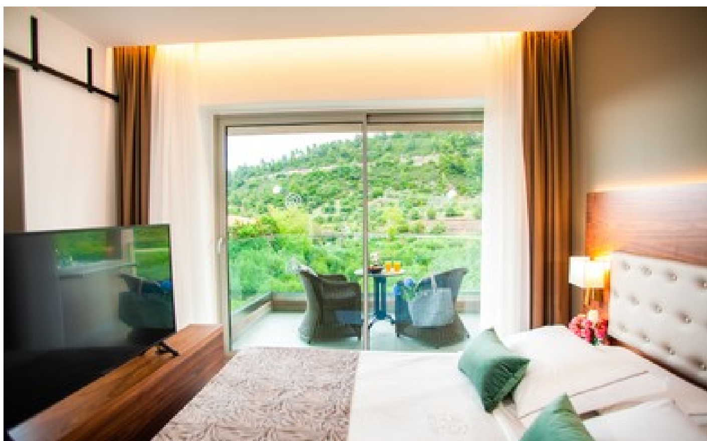
Family Suite Garden View