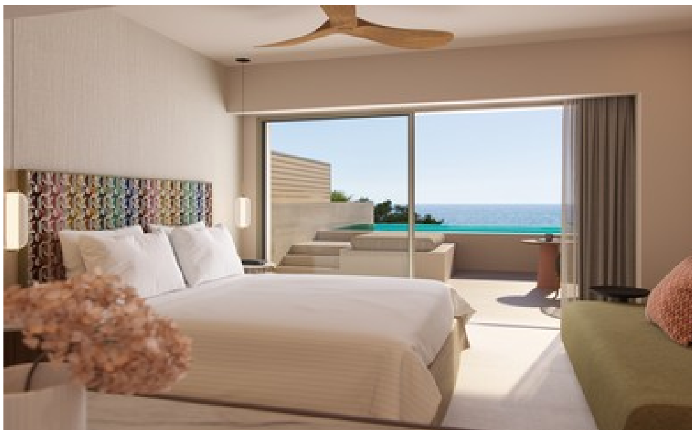
Rooftop Deluxe Double Room Mountain View