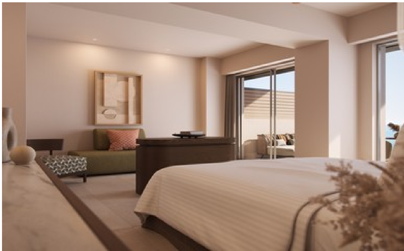
Panorama Junior Suite Private Pool Sea View