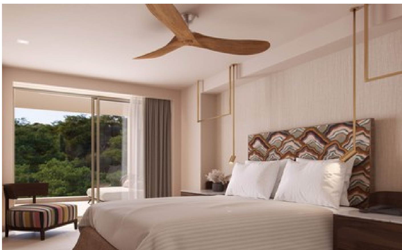
Deluxe Double Room Private Pool Front Sea View