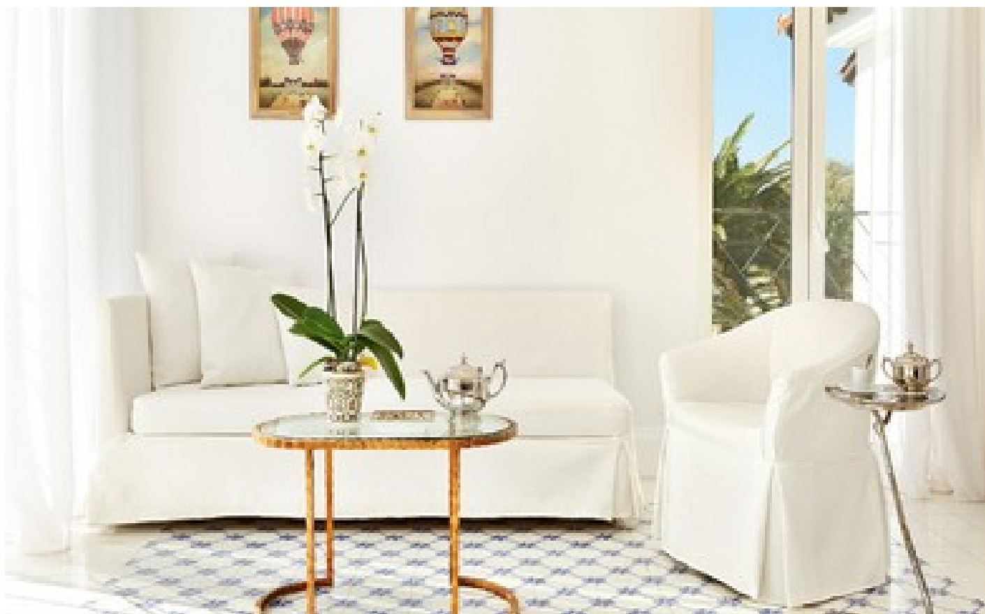
Luxury Bungalow Suite Garden View