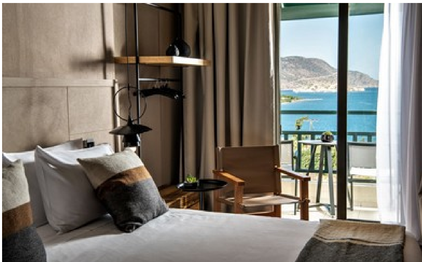
Tropical Nest with sharing pool Garden View