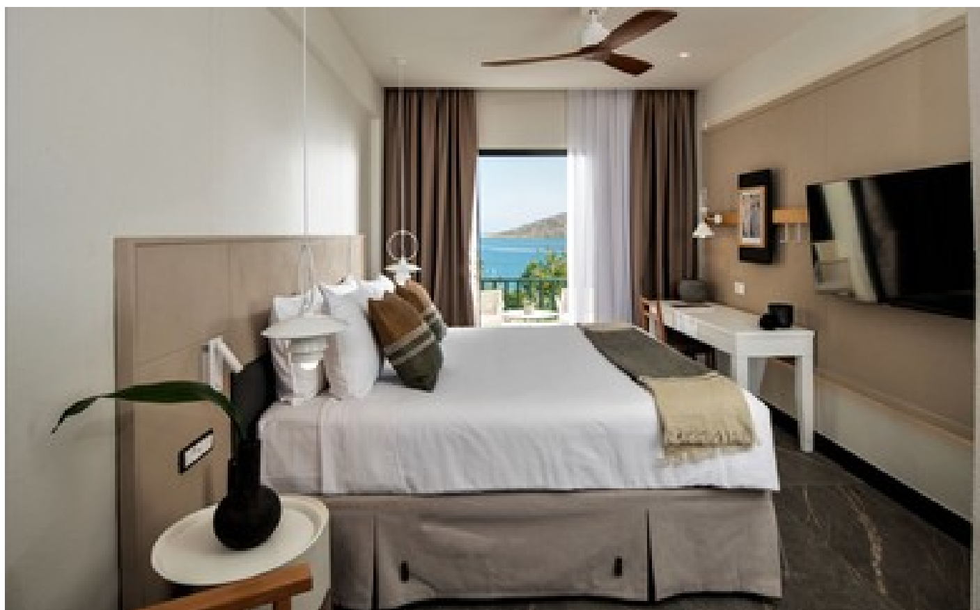
Sapphire Cozy Suite Sea View