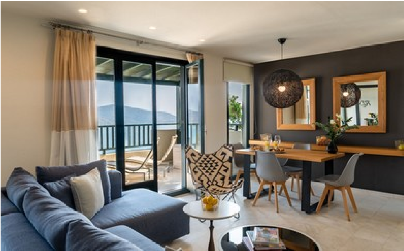
Cool Living Selection