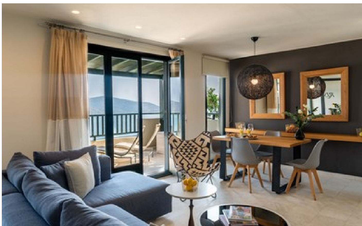
Cool Living Selection