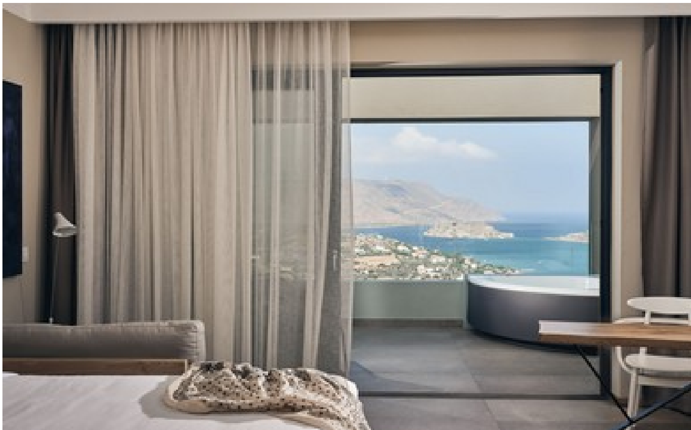
Sapphire Zen Suite with sharing pool Sea View