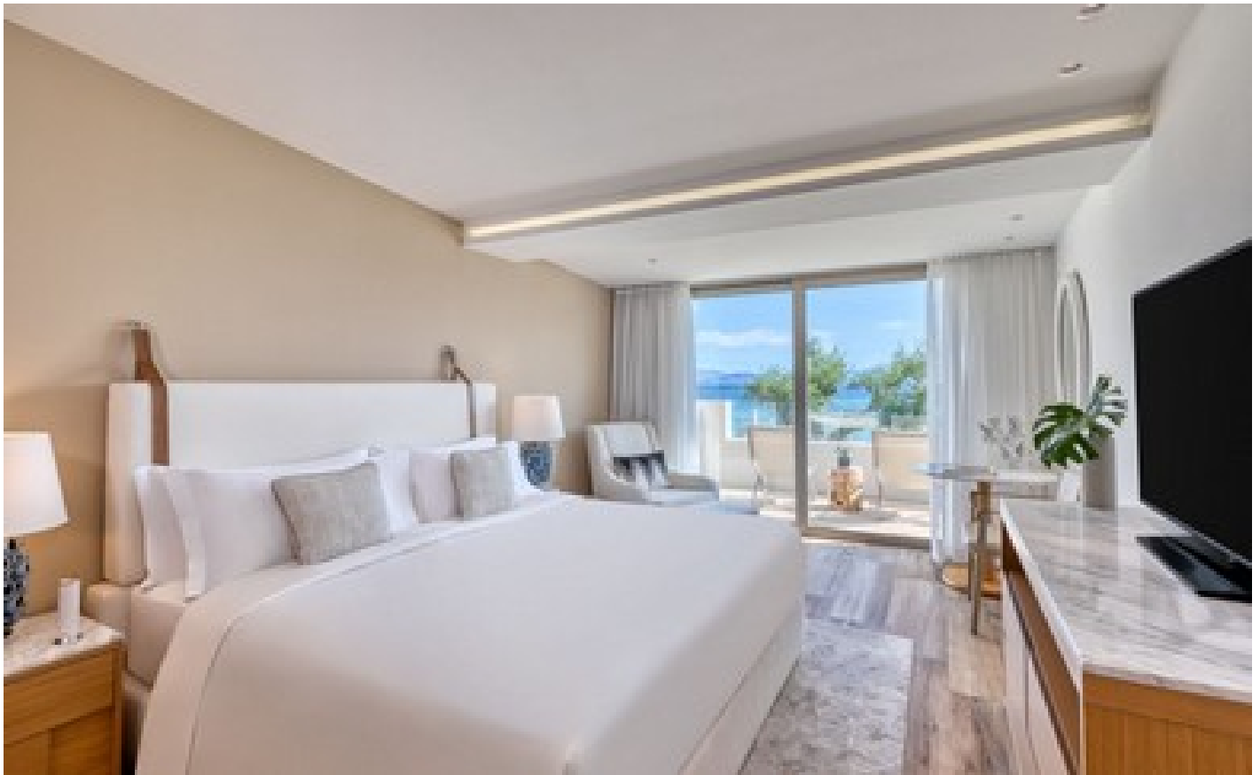
Pavilion Retreat Waterfront Sea View