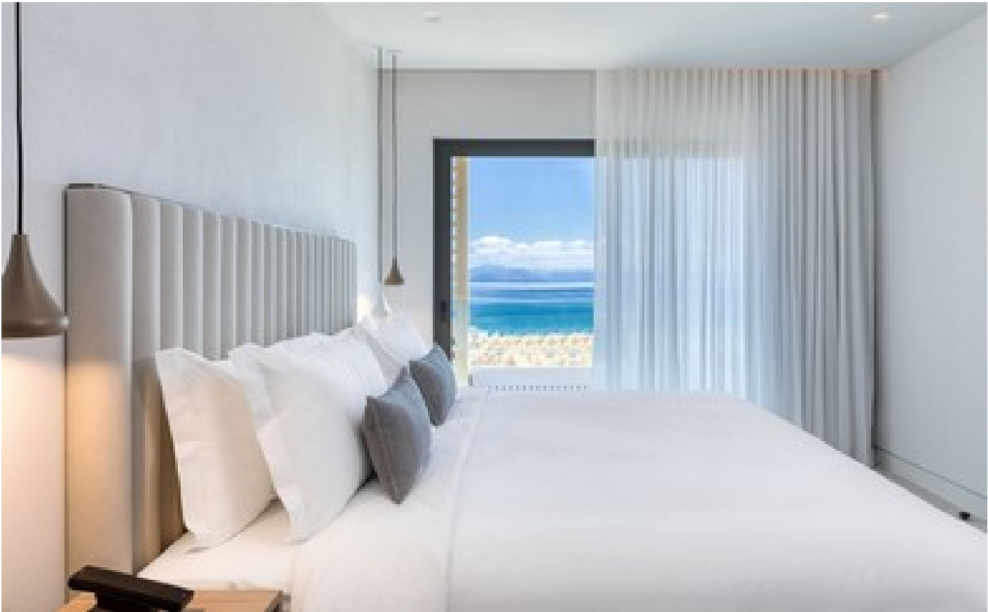
Emerald Retreat Sea View