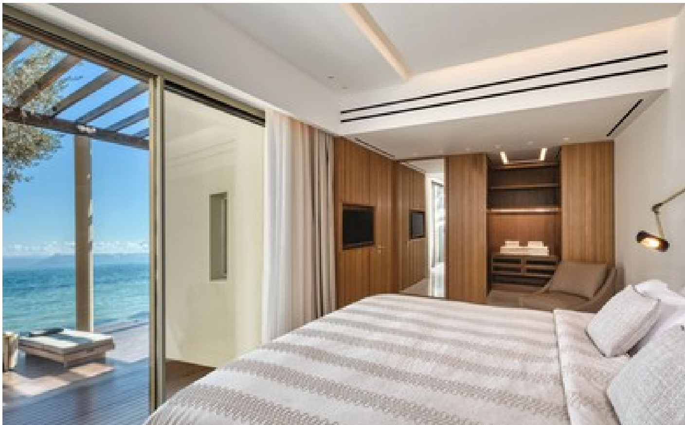
HRH Complex Sea View