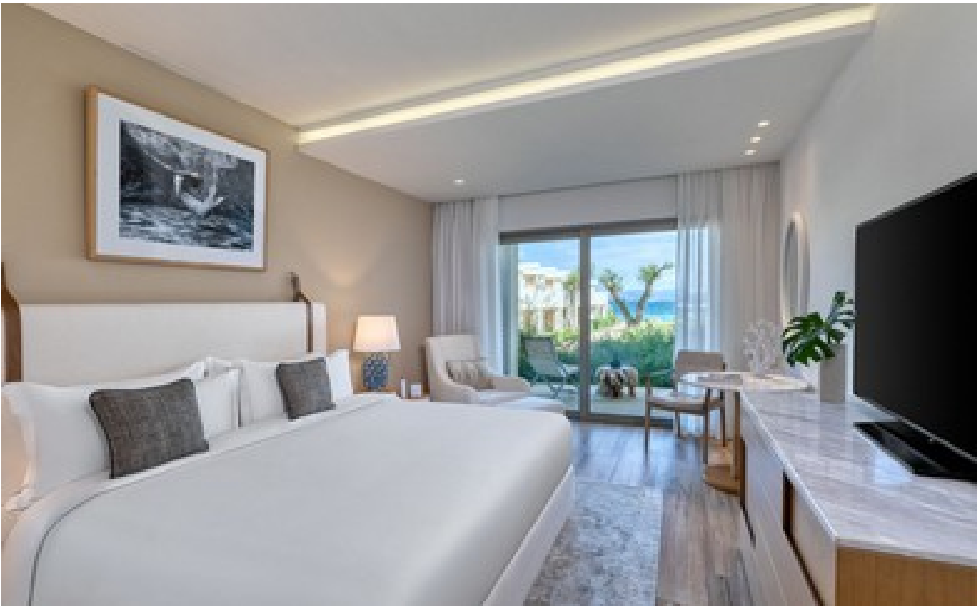
Emerald Retreat Beachfront