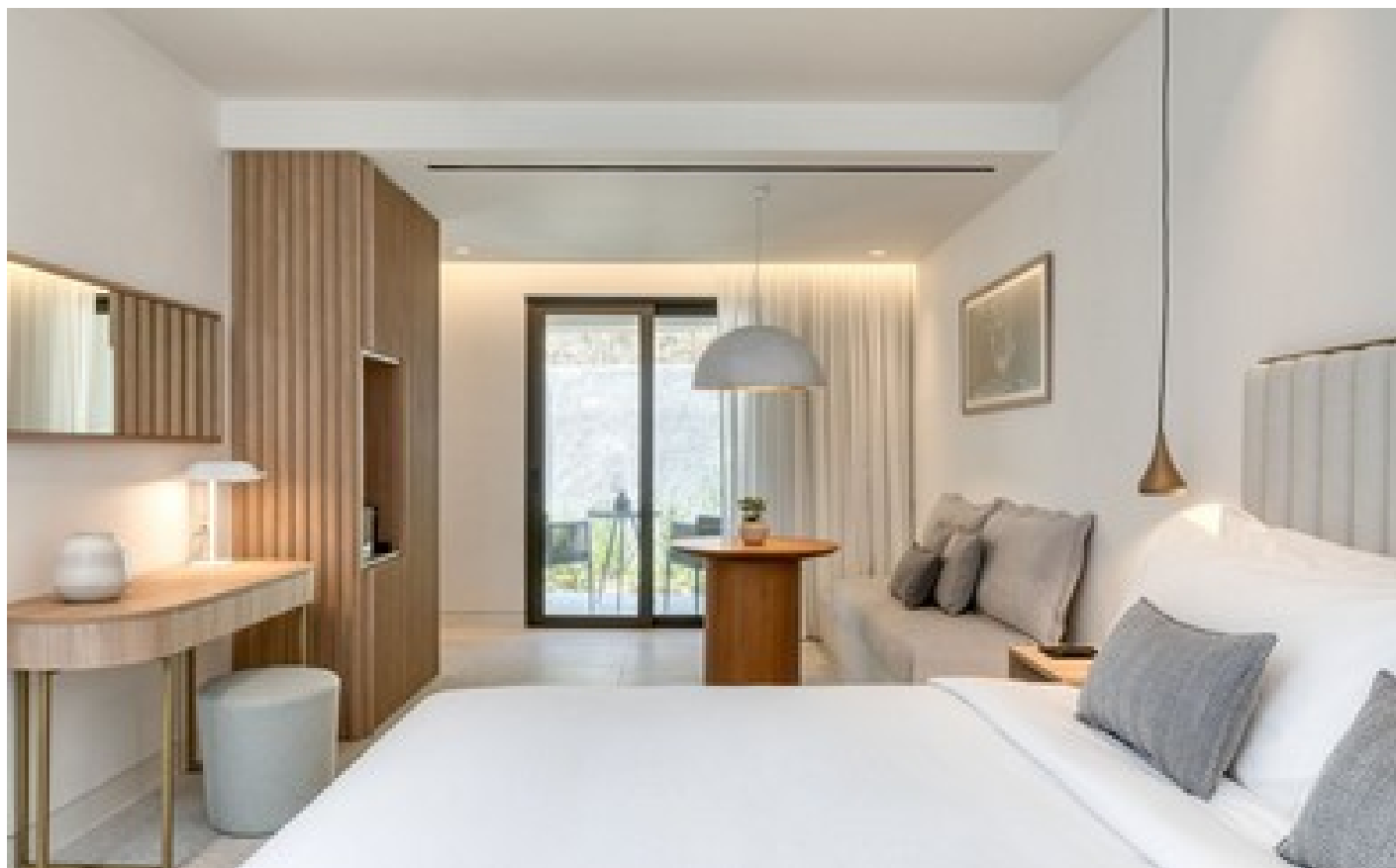
Opal Suite Sea View with outdoor jacuzzi Sea View