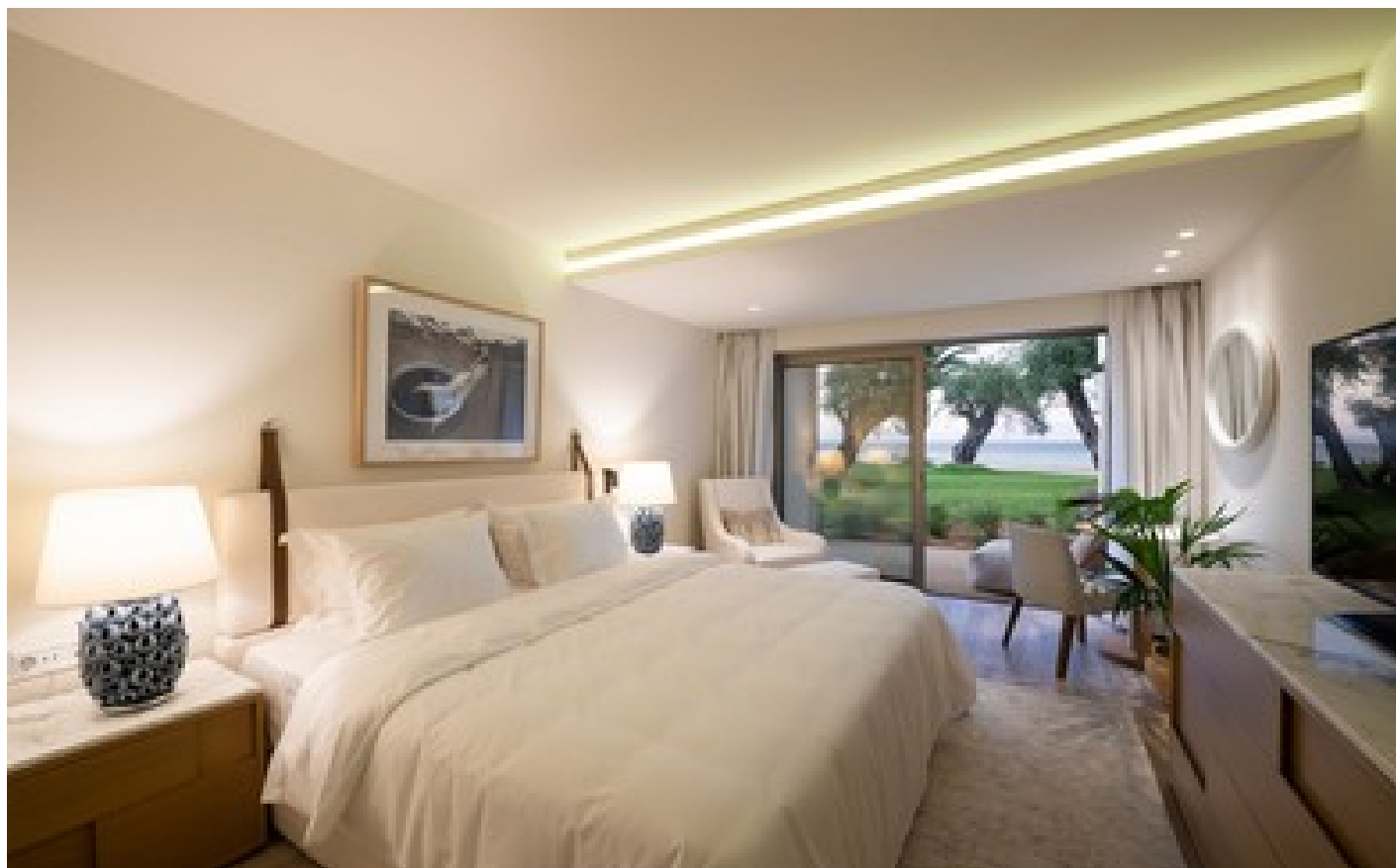
Opal Suite Sea View