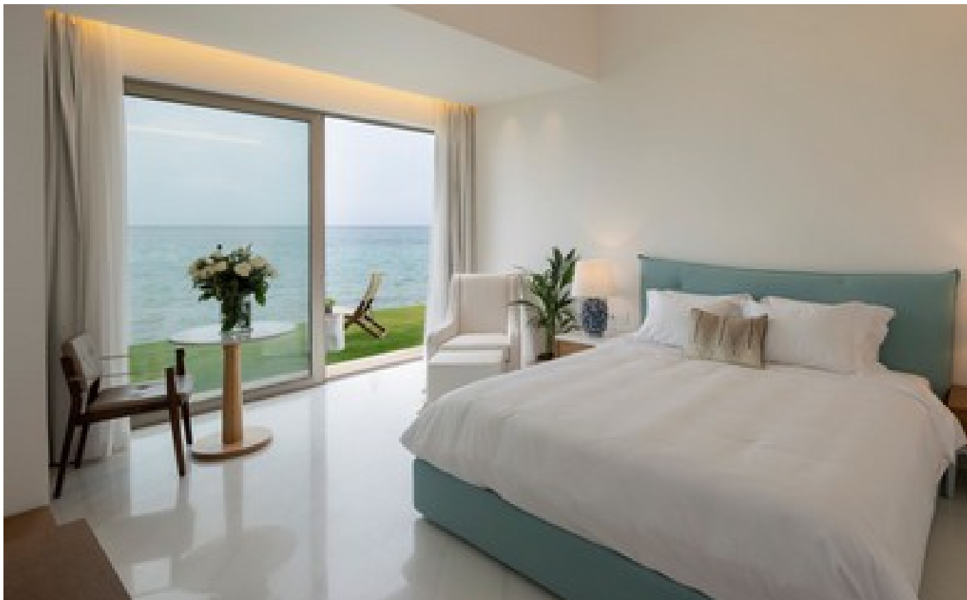
Grand Pavilion Sea View with jacuzzi and pool Sea View