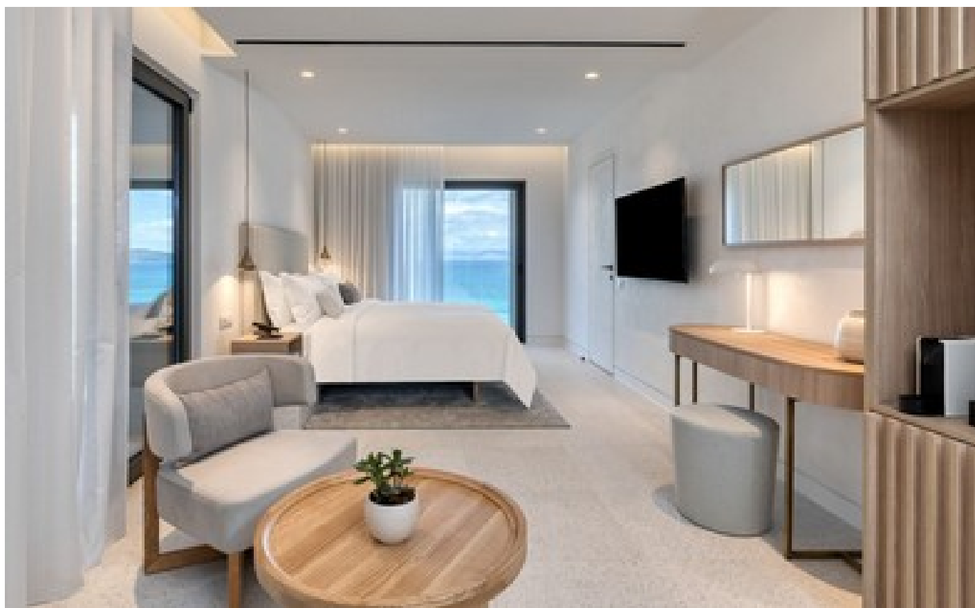
Jade Suite with outdoor jacuzzi Horizon View