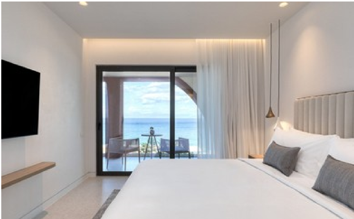
Emerald Suite Sea View