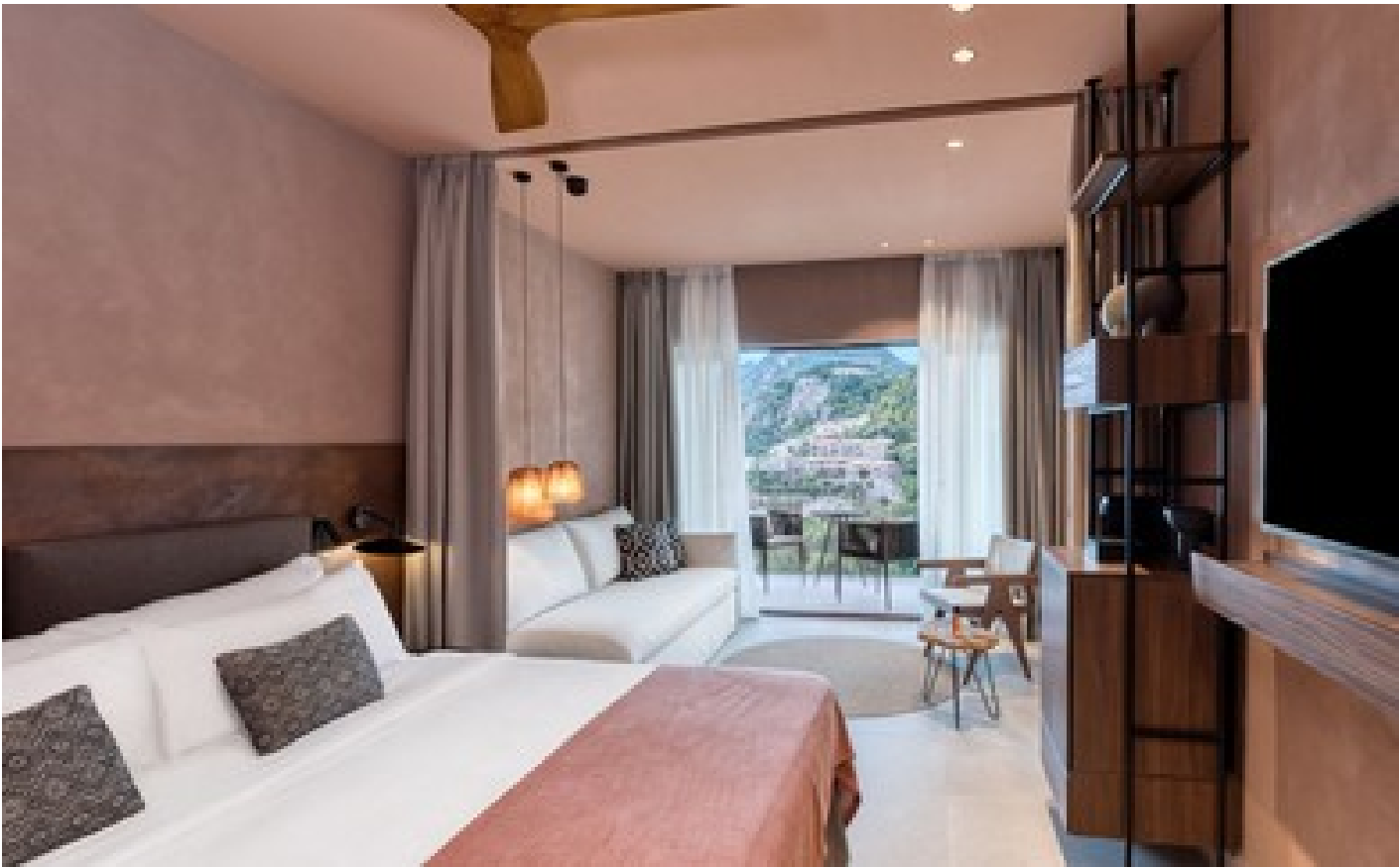
Haute Living Selection