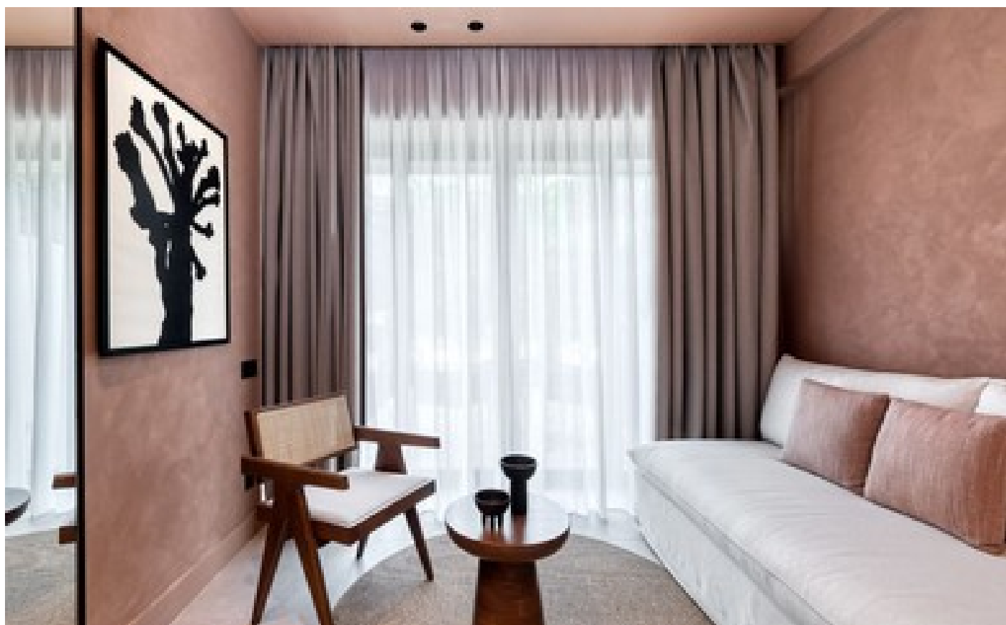
Horizon Junior Suite