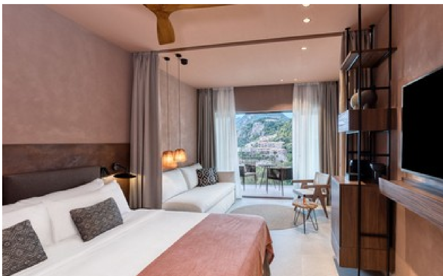
Haute Living Selection