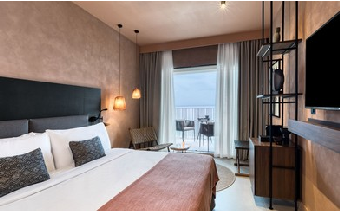
Patio Junior Suite