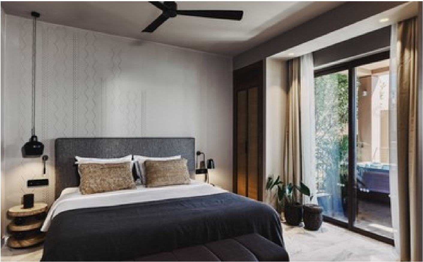
Family Suite SV with Outdoor Jacuzzi