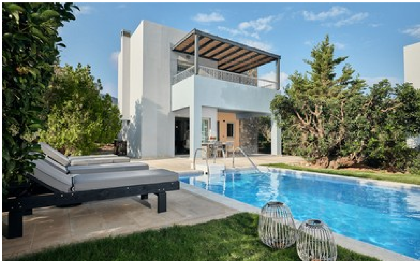
Private Residence three bedrooms with private pool