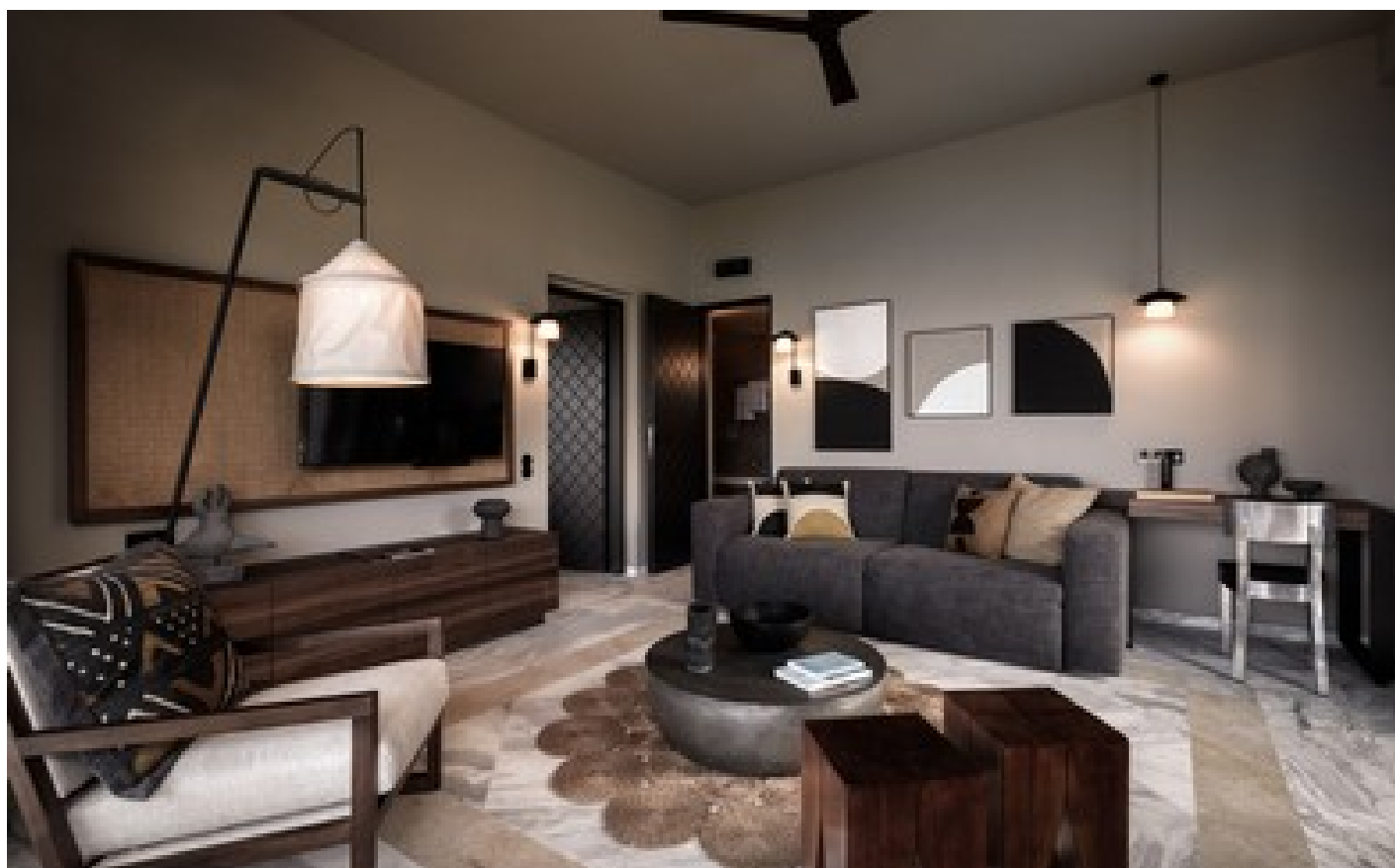
Premium 1 Bdr Suite, SV with Outdoor Jacuzzi