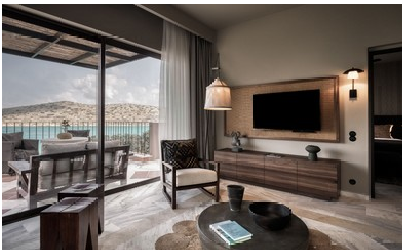
Premium 1 Bdr Suite, SV with Private Pool