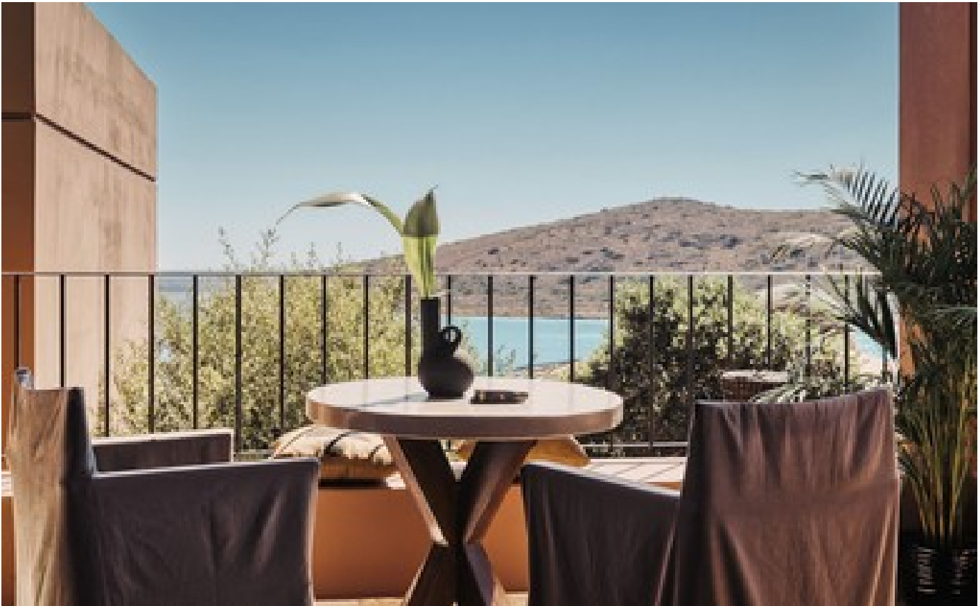
Family Suite SV with Private Pool