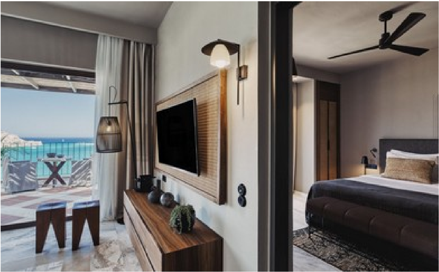
Luxury Family 2 Bdr Suite SV with Outdoor Jacuzzi