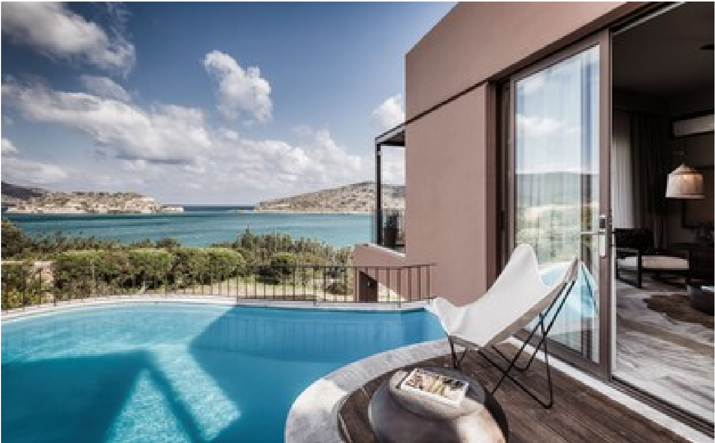
Family Suite GV with Outdoor Jacuzzi