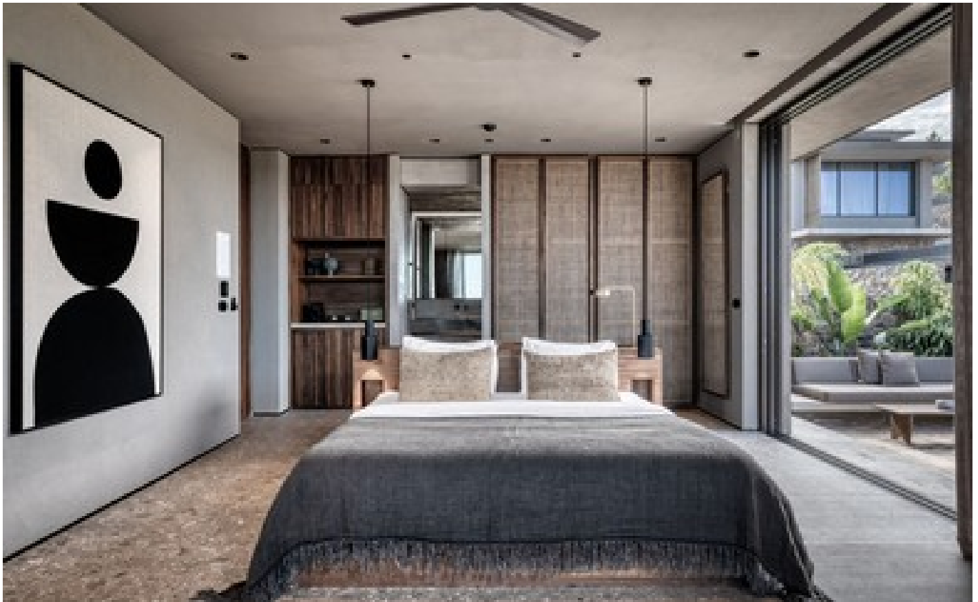
Sapphire Family Pavilion Private Pool Sea View