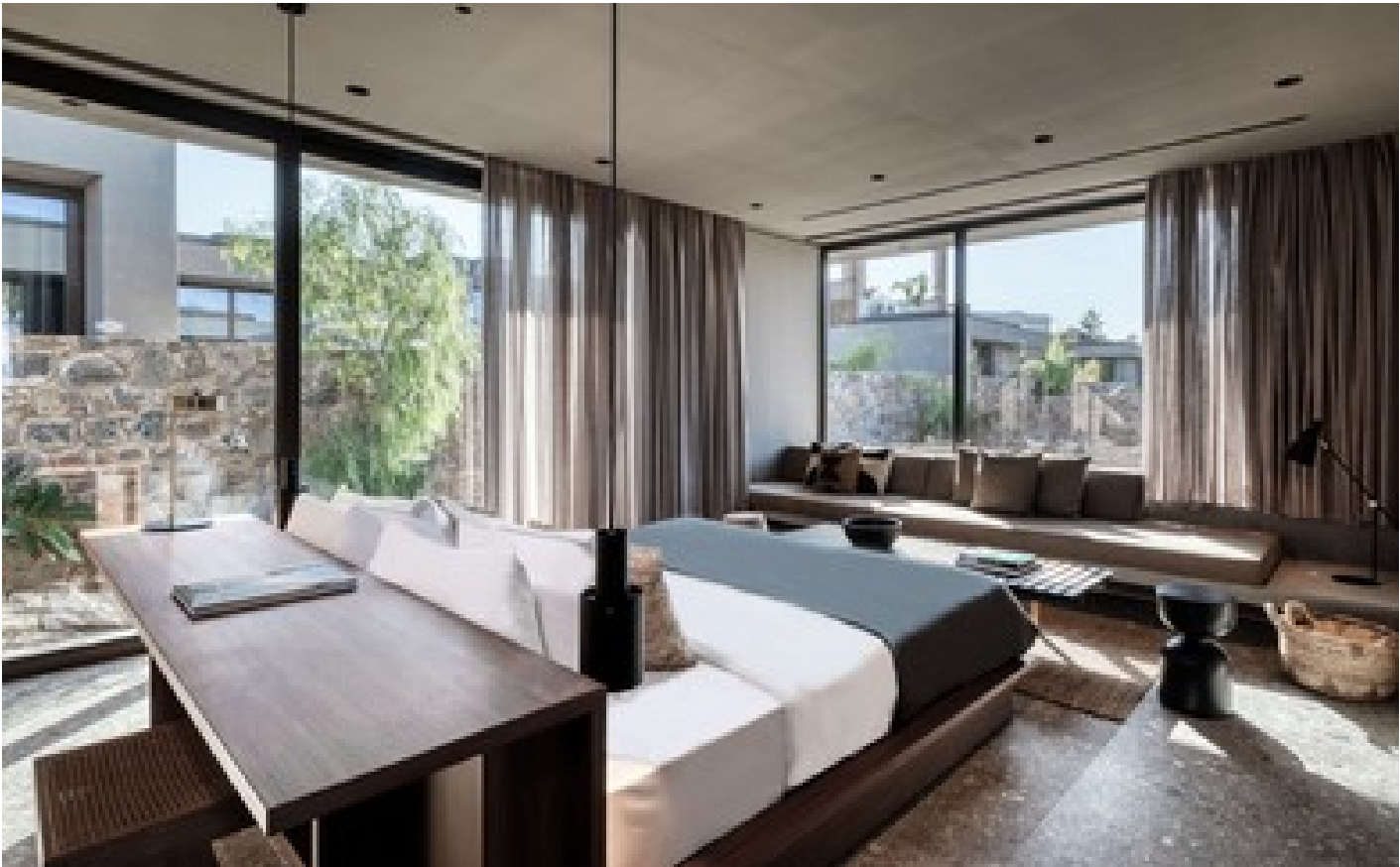
Tropical Family Room, Shared Pool Garden View