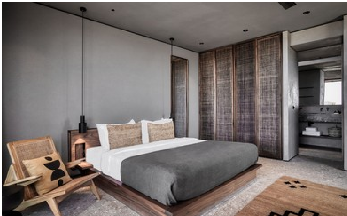
Tropical Family Bungalow Garden View