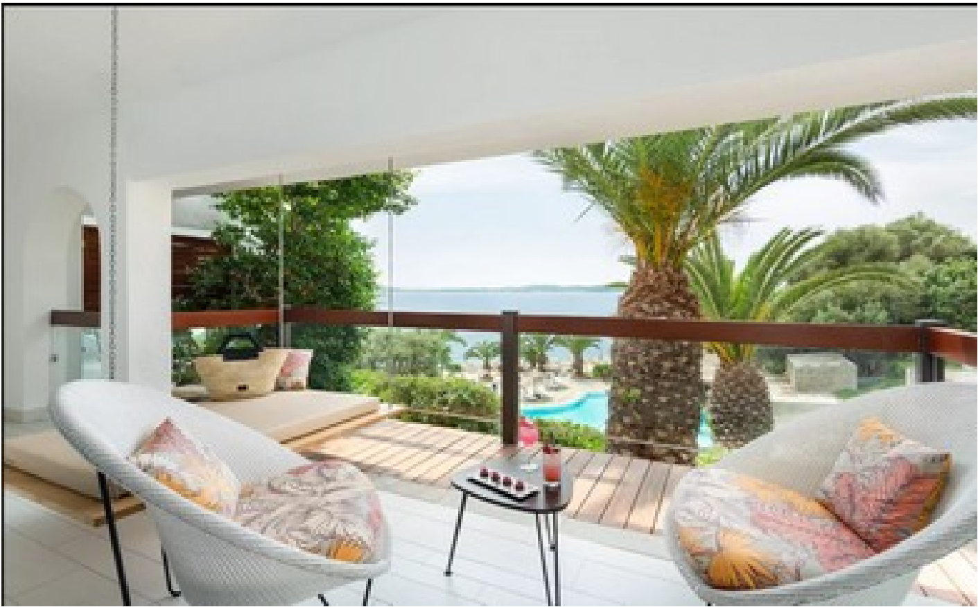
Bungalow on the Sea Front