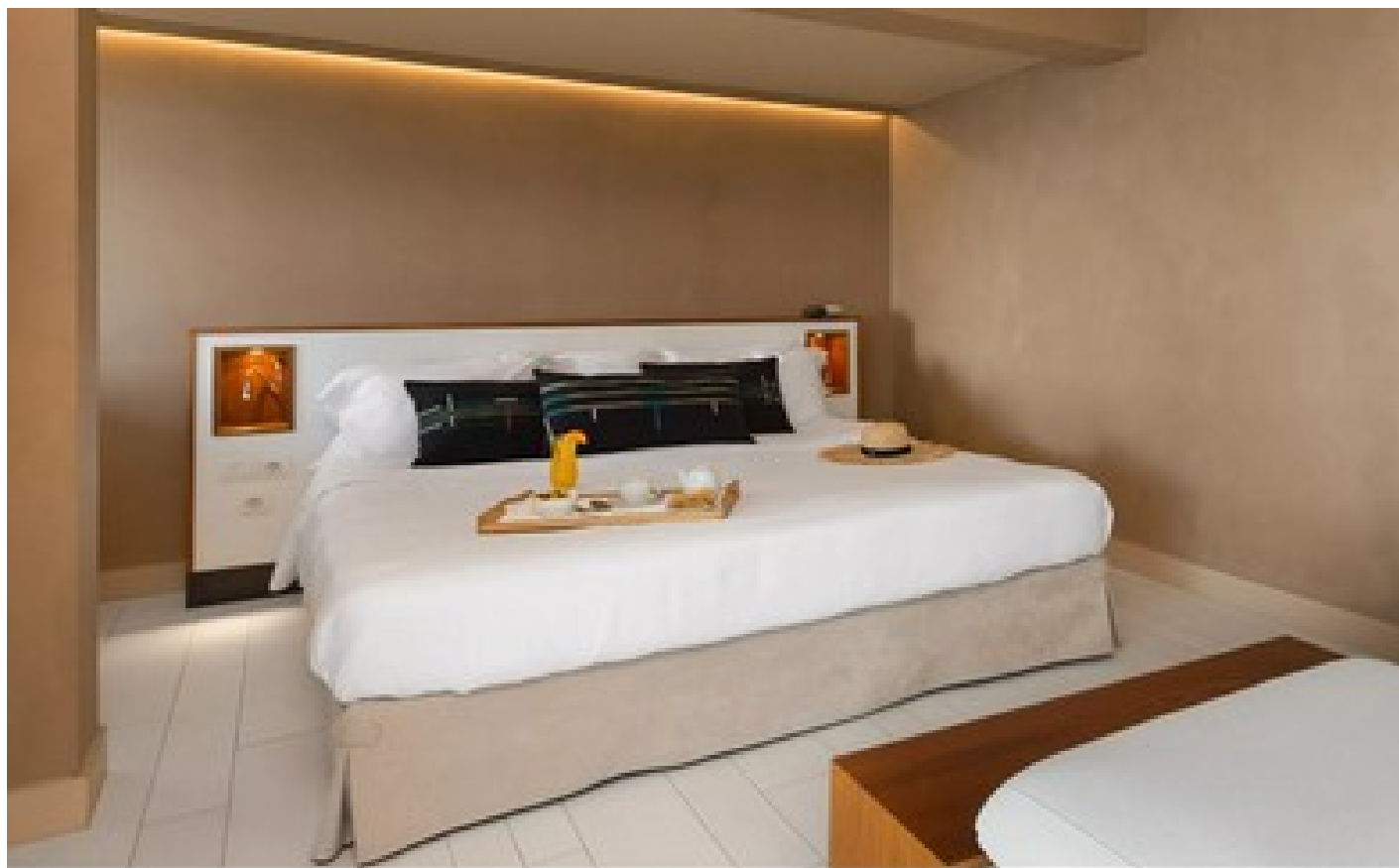
Bungalow with Sea View