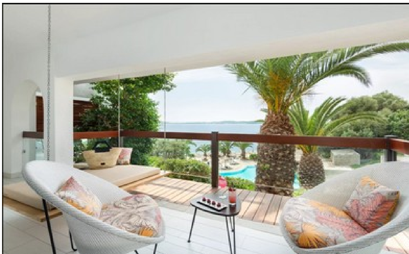
Bungalow on the Sea Front