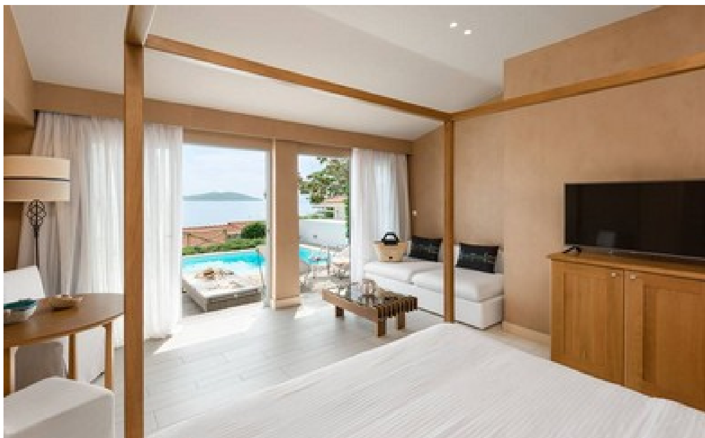
Presidential Bungalow Sea Front Private Pool