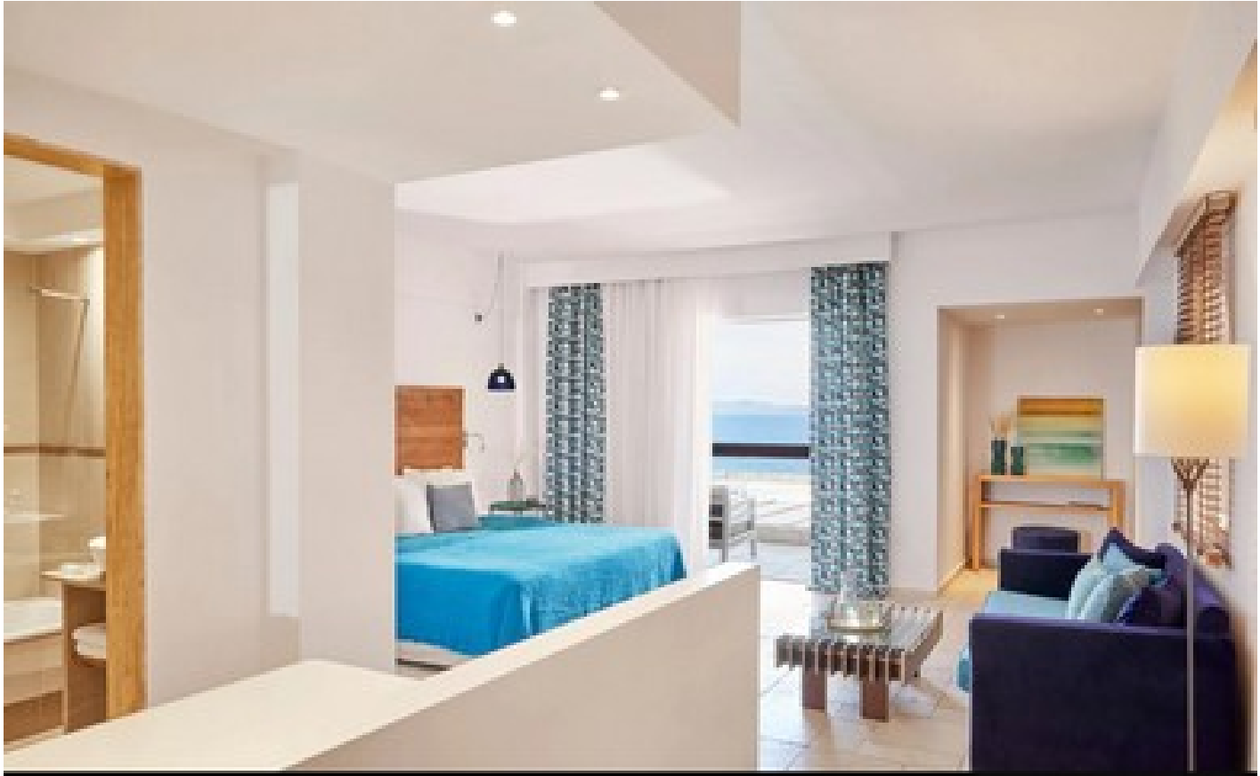
Junior Suite on the Sea Front