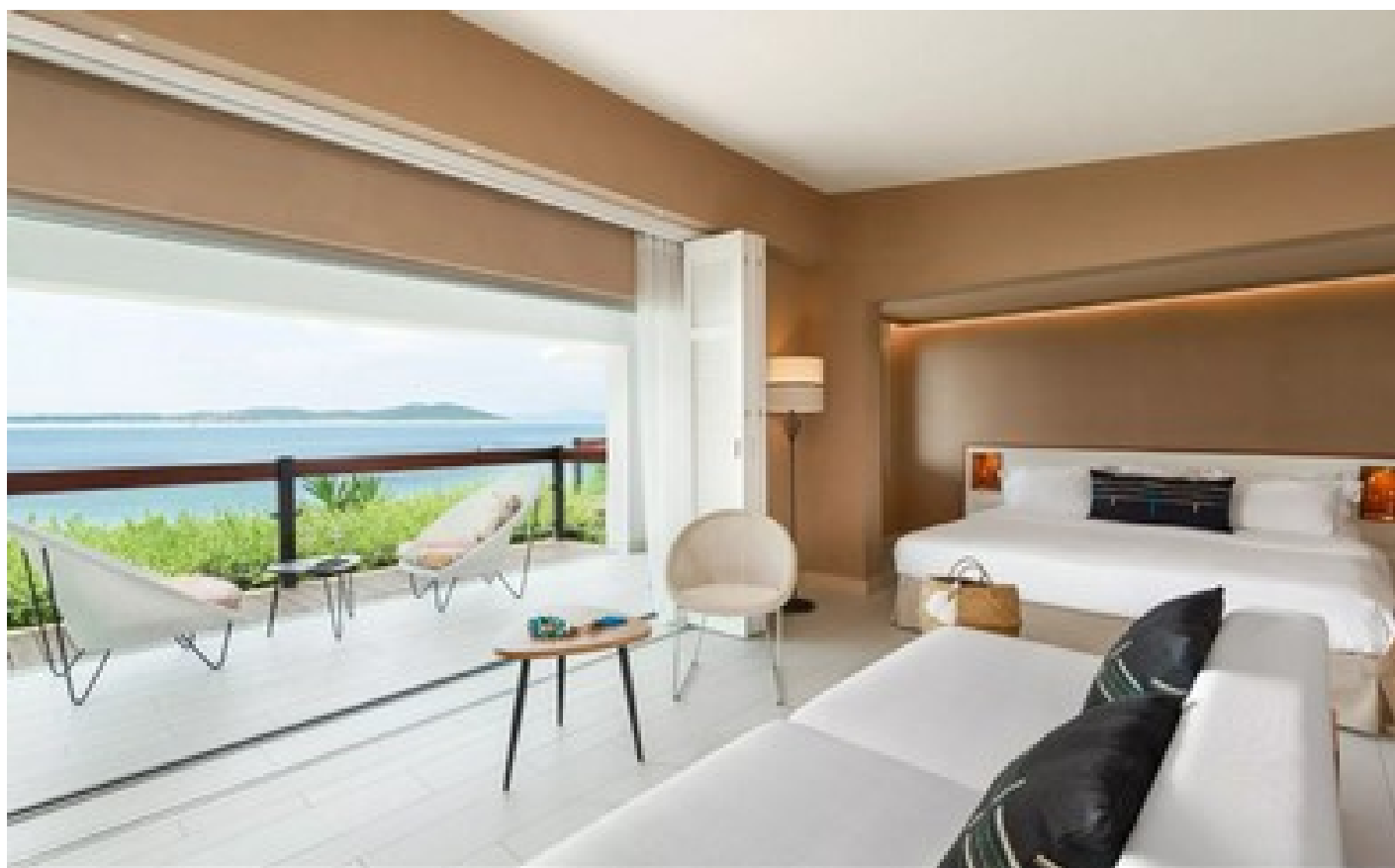
Bungalow Sea View with Private Pool