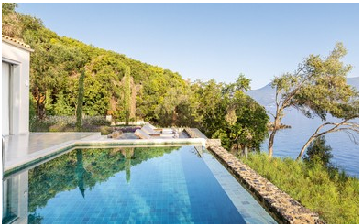
Palazzo Sissy Private Pool on the Rocs Direct Sea View