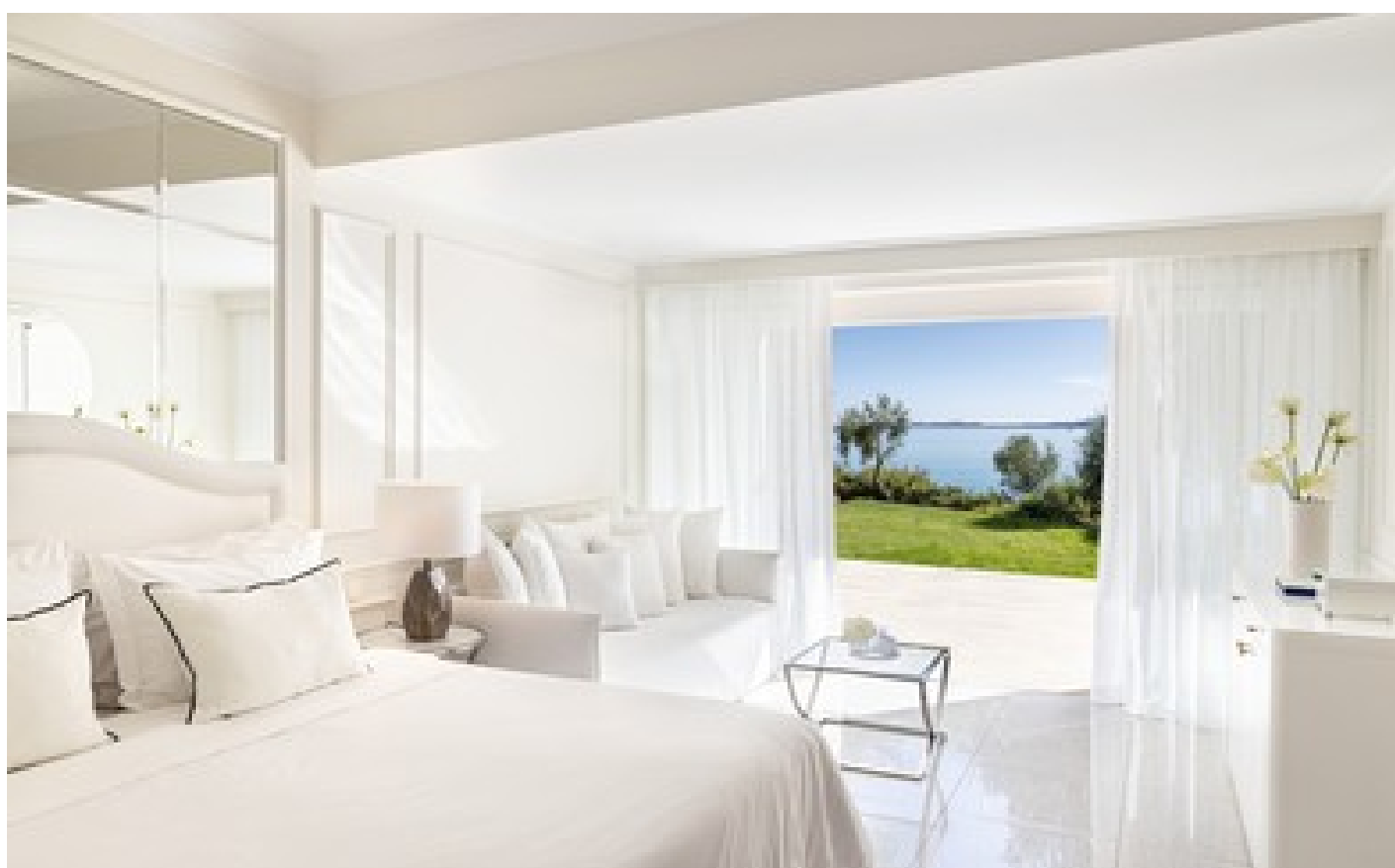
Junior Bungalow Suite Waterfront Direct Sea View