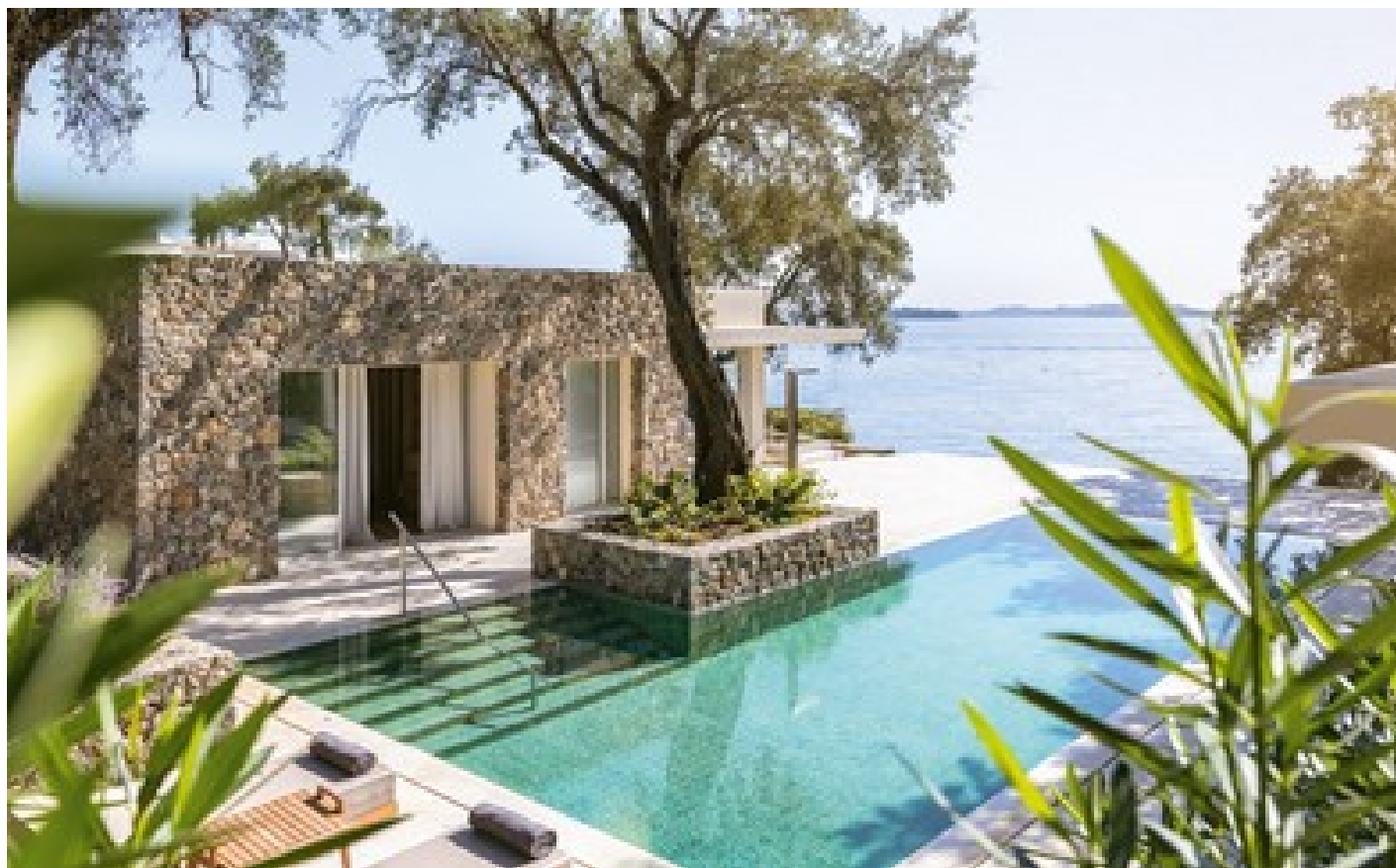
Palazzo di Lago Private Pool on the Rocs Direct Sea View