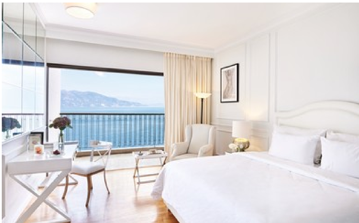
Cruise Guestroom Sea View