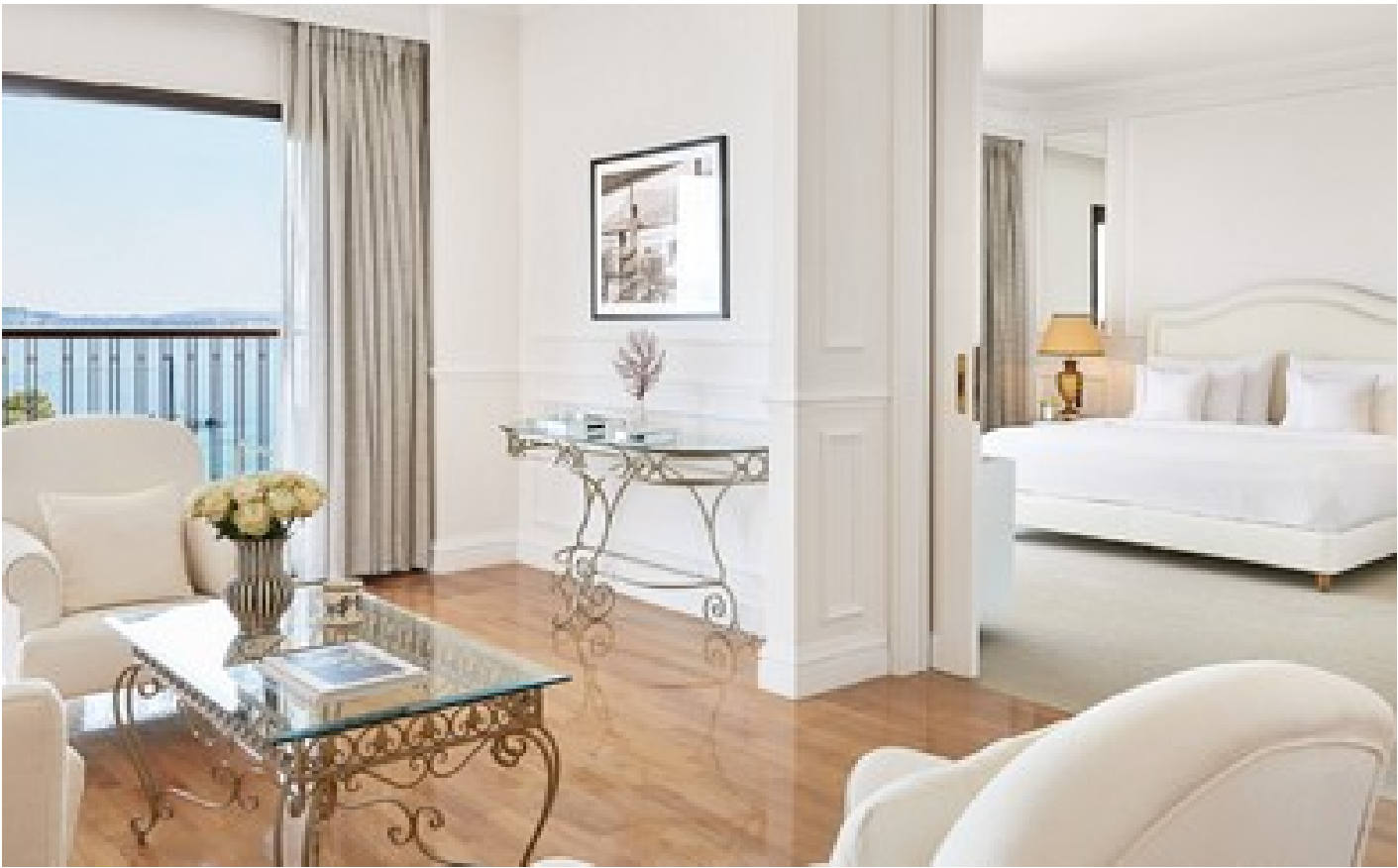
Imperial 2 Bedroom Suite Sea View