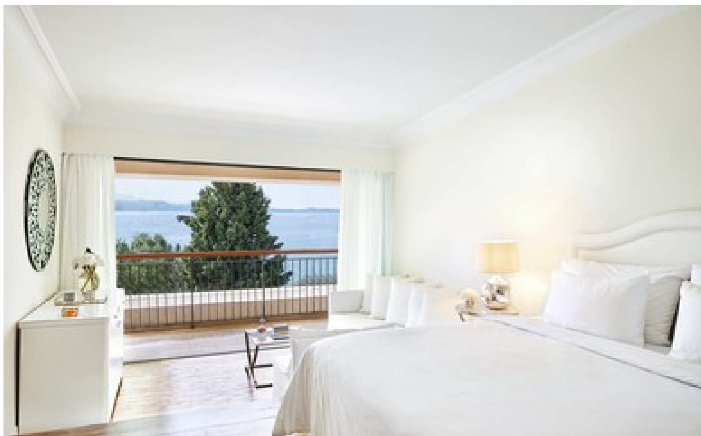
Junior Suite Waterfront Direct Sea View