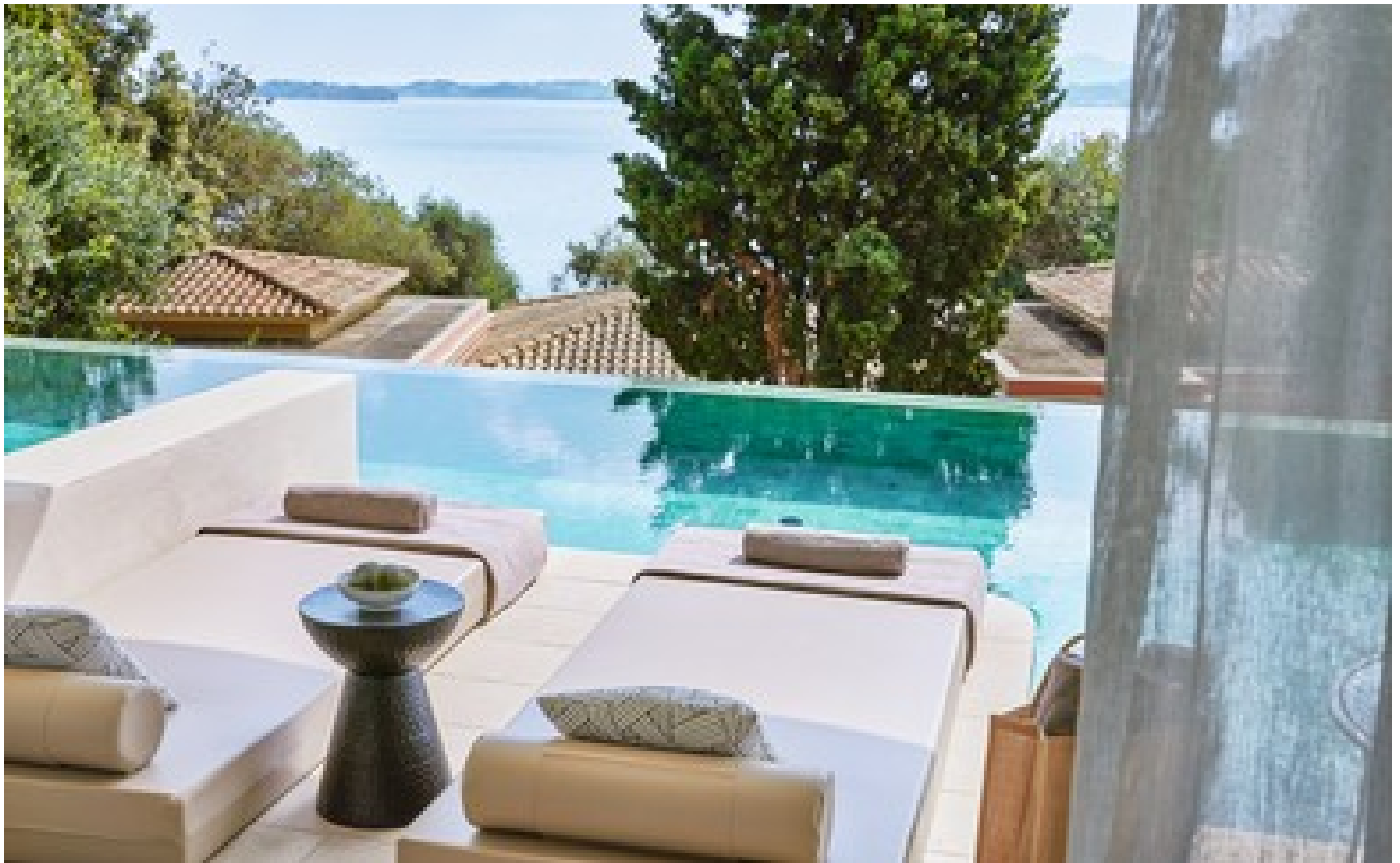
Family Bungalow Open Plan Sharing Pool Garden View