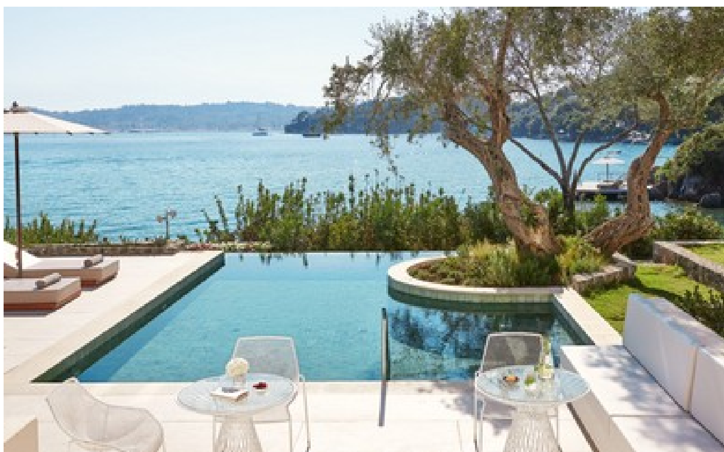
2-Bedroom Villa Waterfront Private Pool Direct Sea View