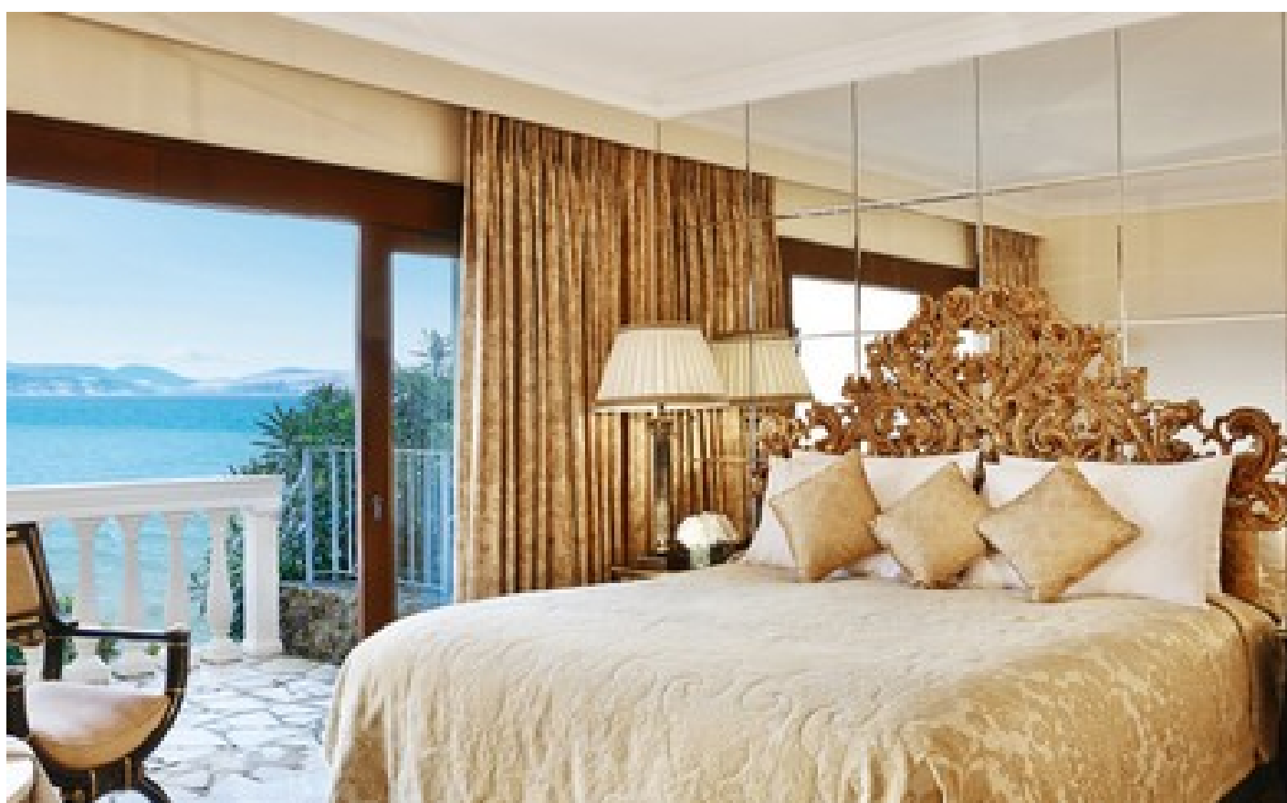
Dream Villa Beachfront Private Pool, 3 Bedroom Direct Sea View