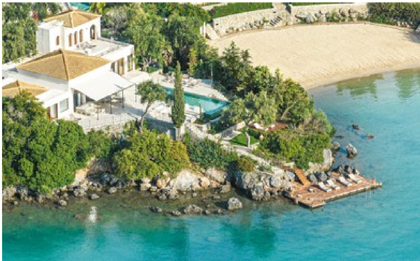
Medusa Estate Panoramic View