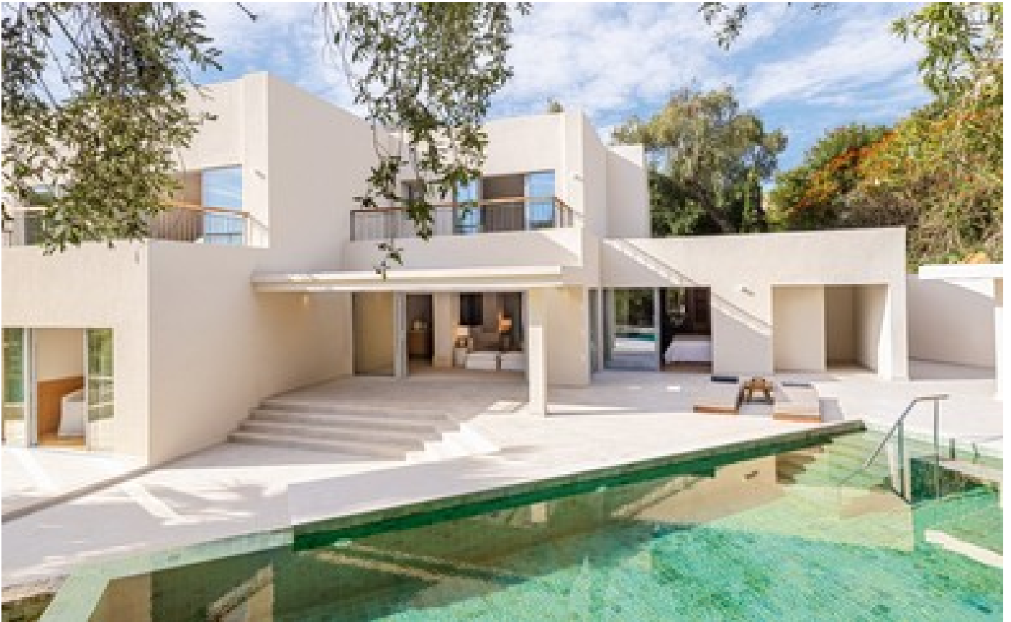
Dream Villa Beachfront Private Pool, 2 Bedroom + 1 Master Direct Sea View