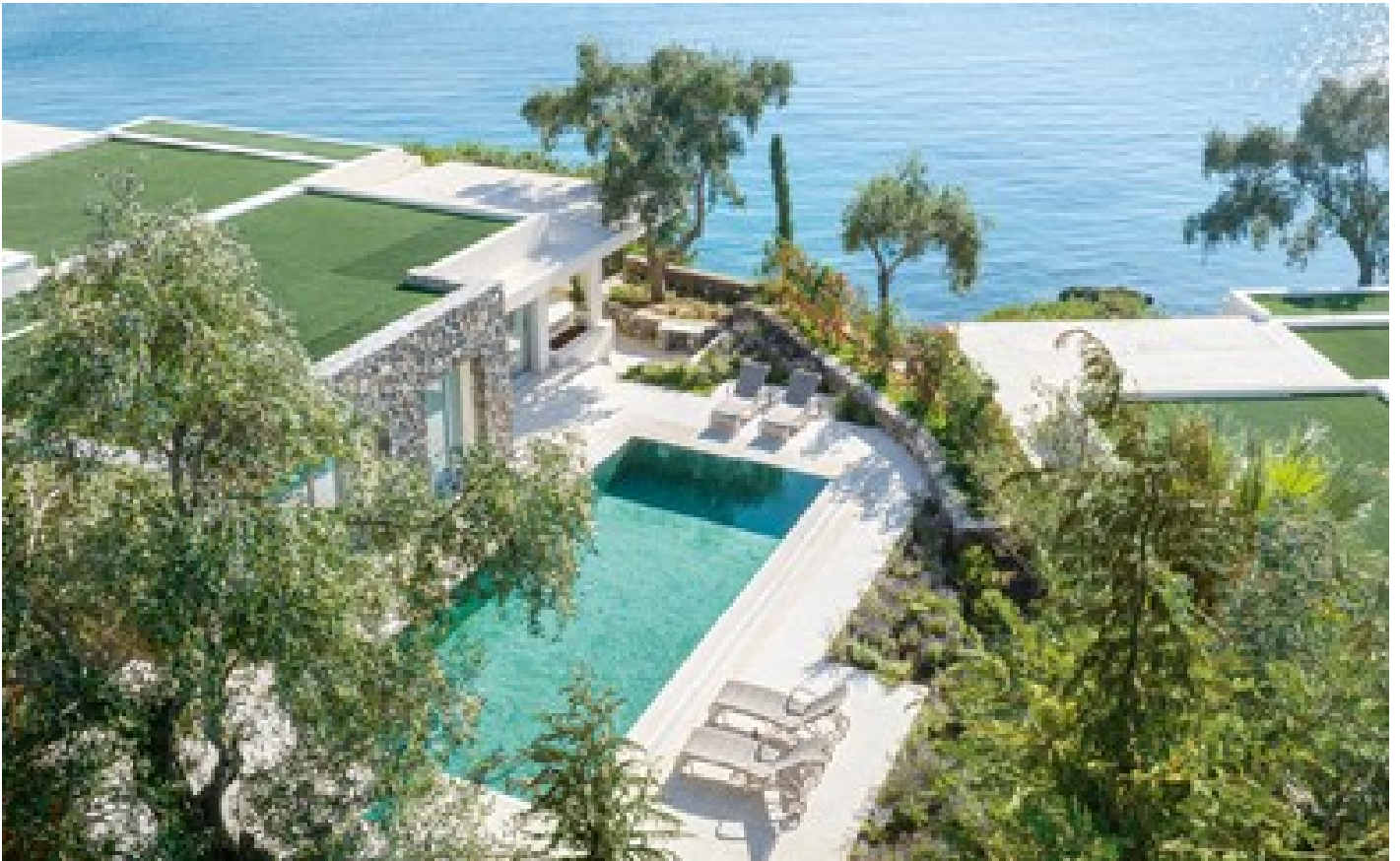
3-Bedroom Villa Waterfront Private Pool Direct Sea View