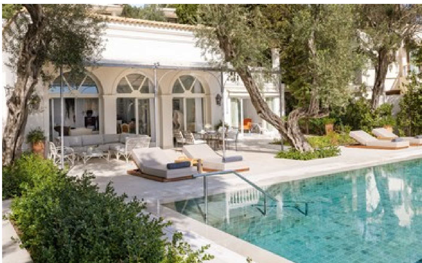
Palazzo Imperiale On Private Peninsula, 4 Bedroom Direct Sea View