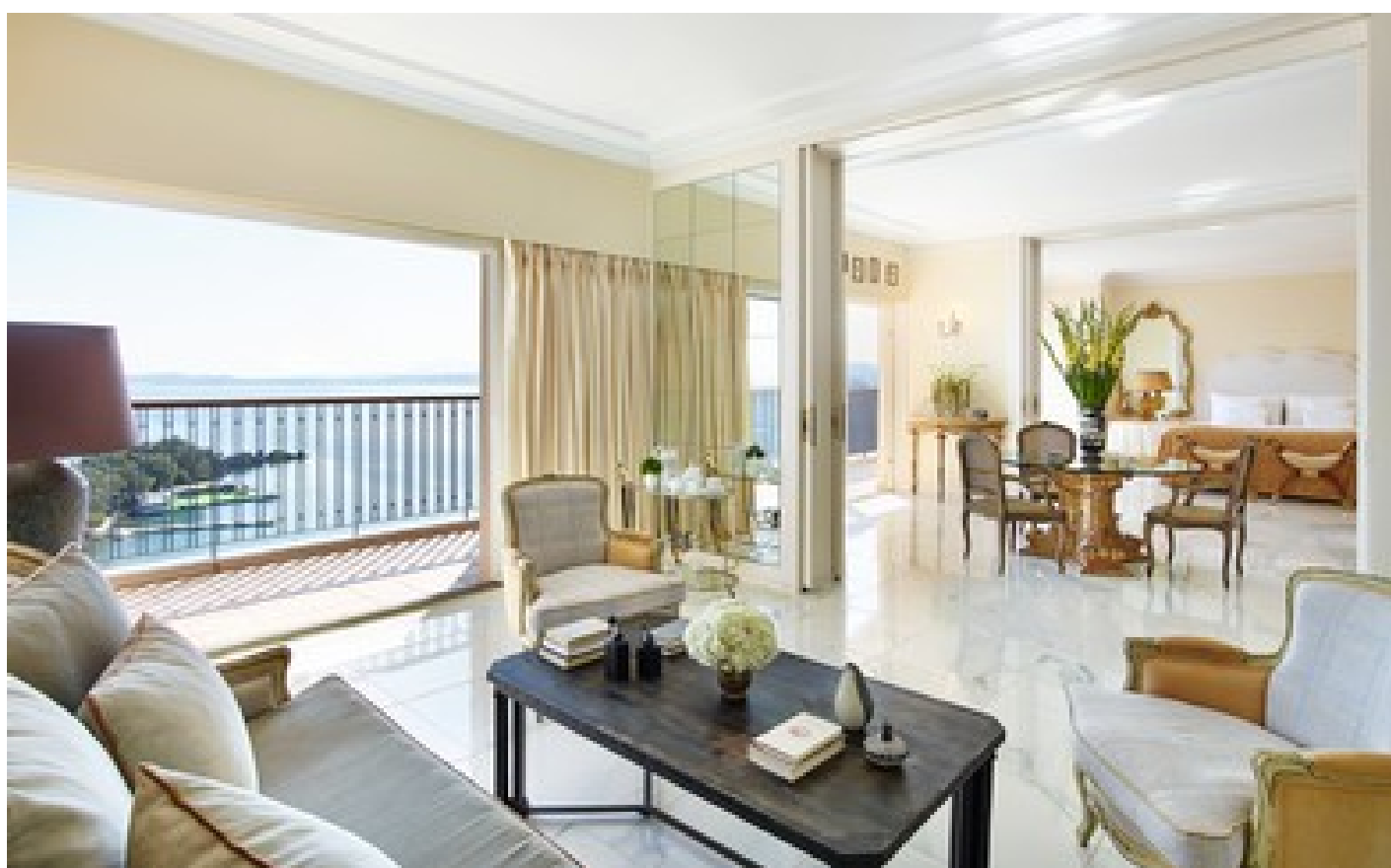
Deluxe Suite Sea View