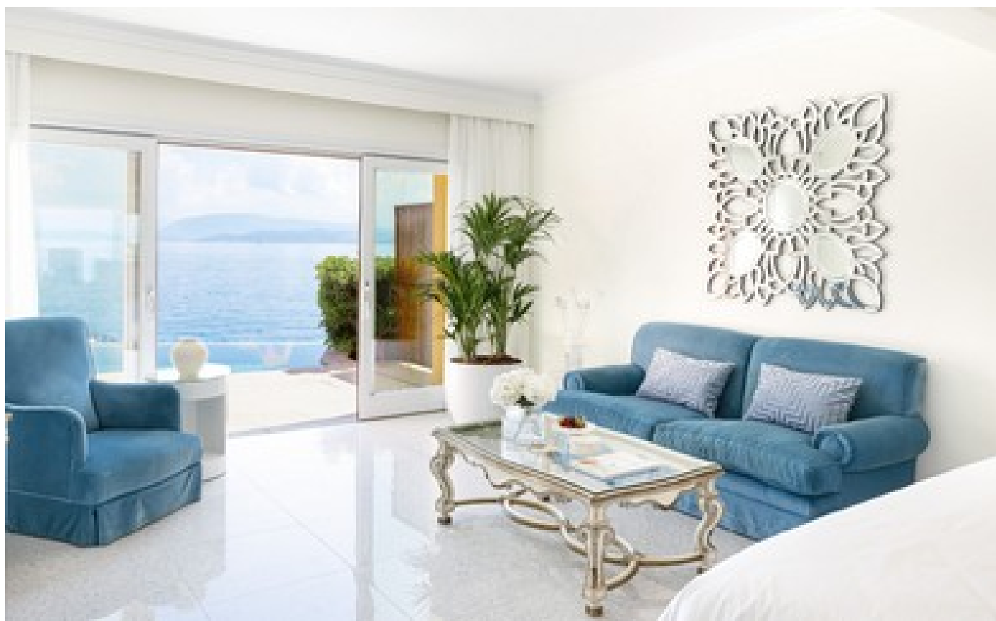
2-Bedroom Beachfront Villa Private Pool Direct Sea View