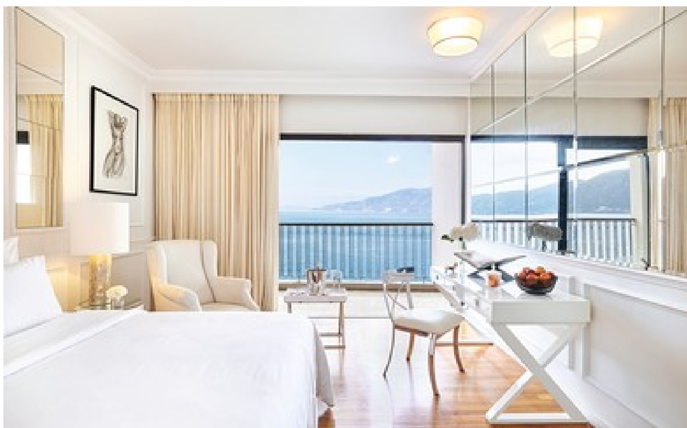
Deluxe Family Suite Sea View