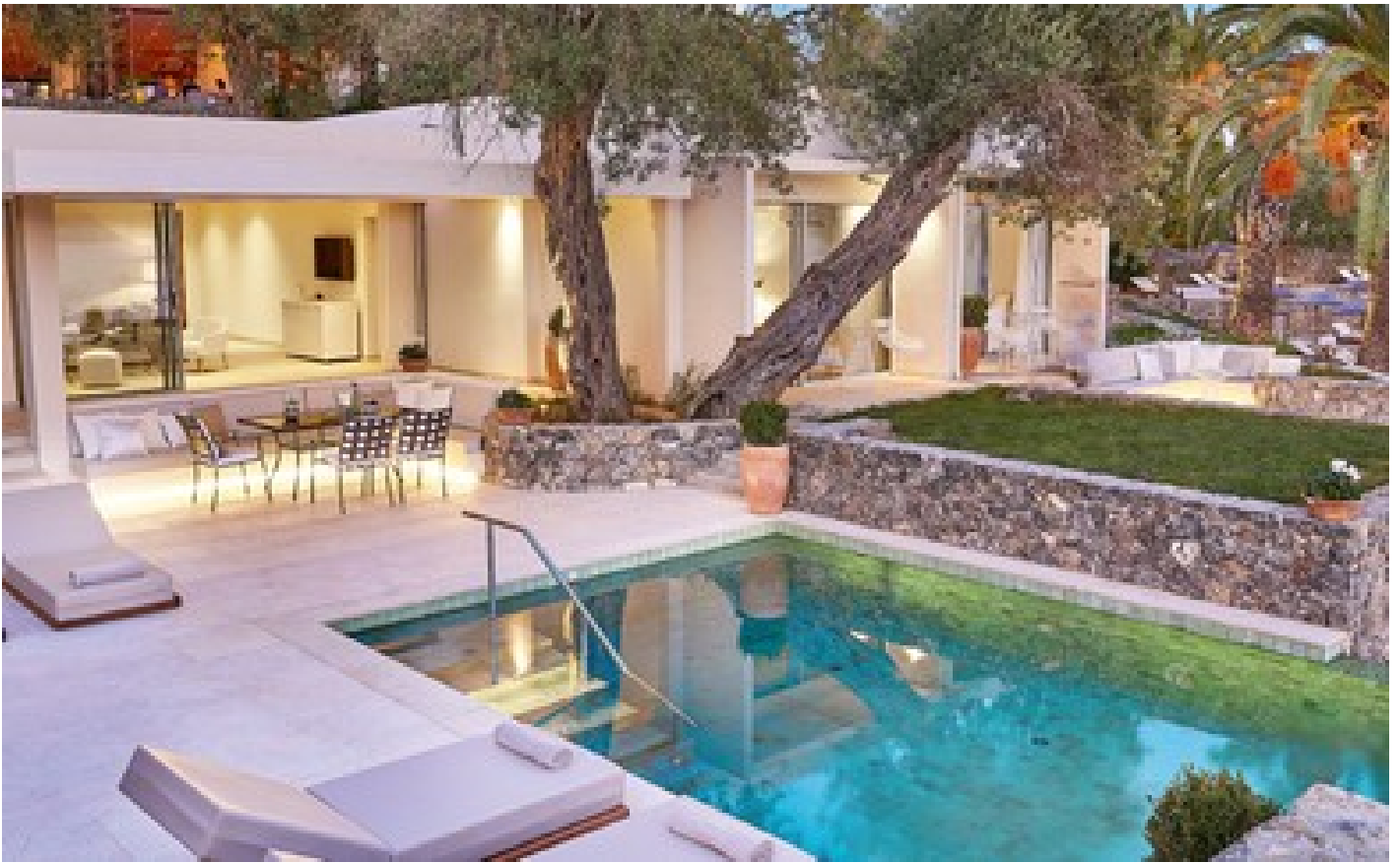
Two Villa Residence with Private Beach, 4 Bedroom Direct Sea View