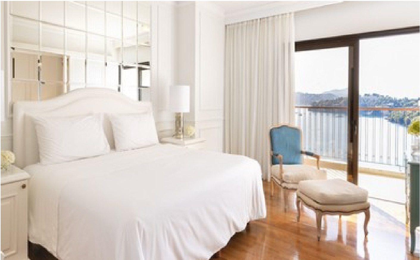
Imperial Suite Sea View