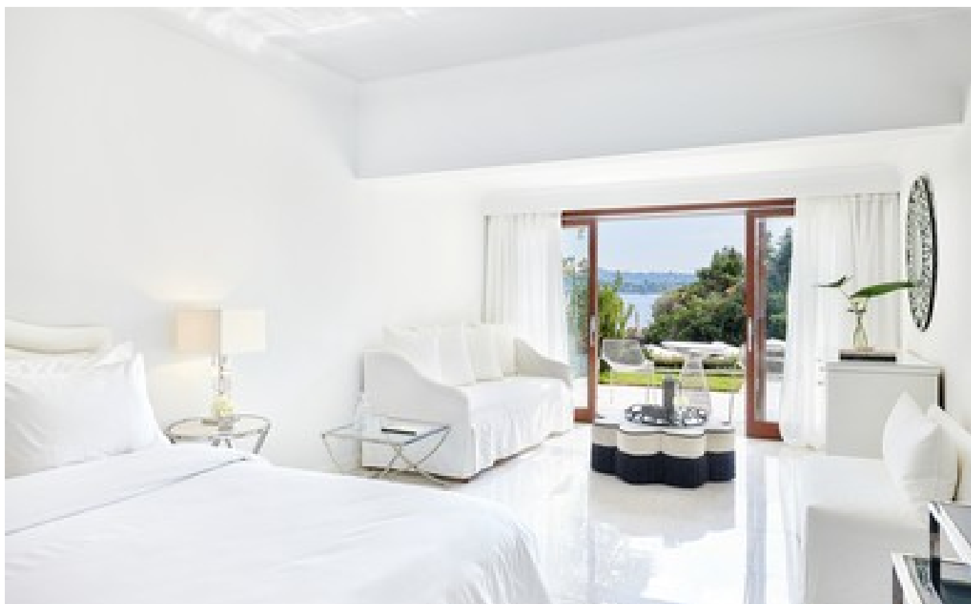
Maisonette on the Rocs Direct Sea View