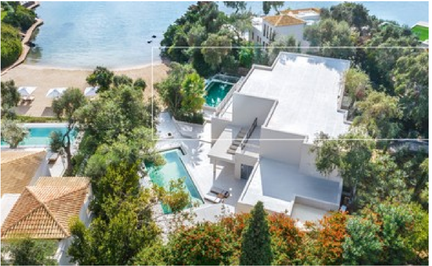
Royal Pavilion Private Pools, 6 Bedroom Direct Sea View