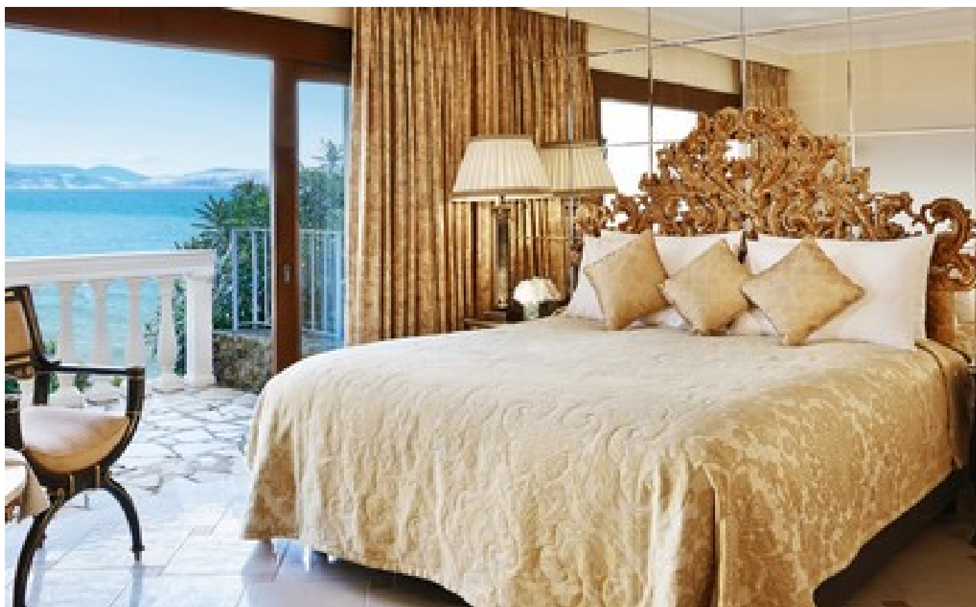
Palazzo Odyssia Private Pool on the Rocs, 4 Bedroom Direct Sea View