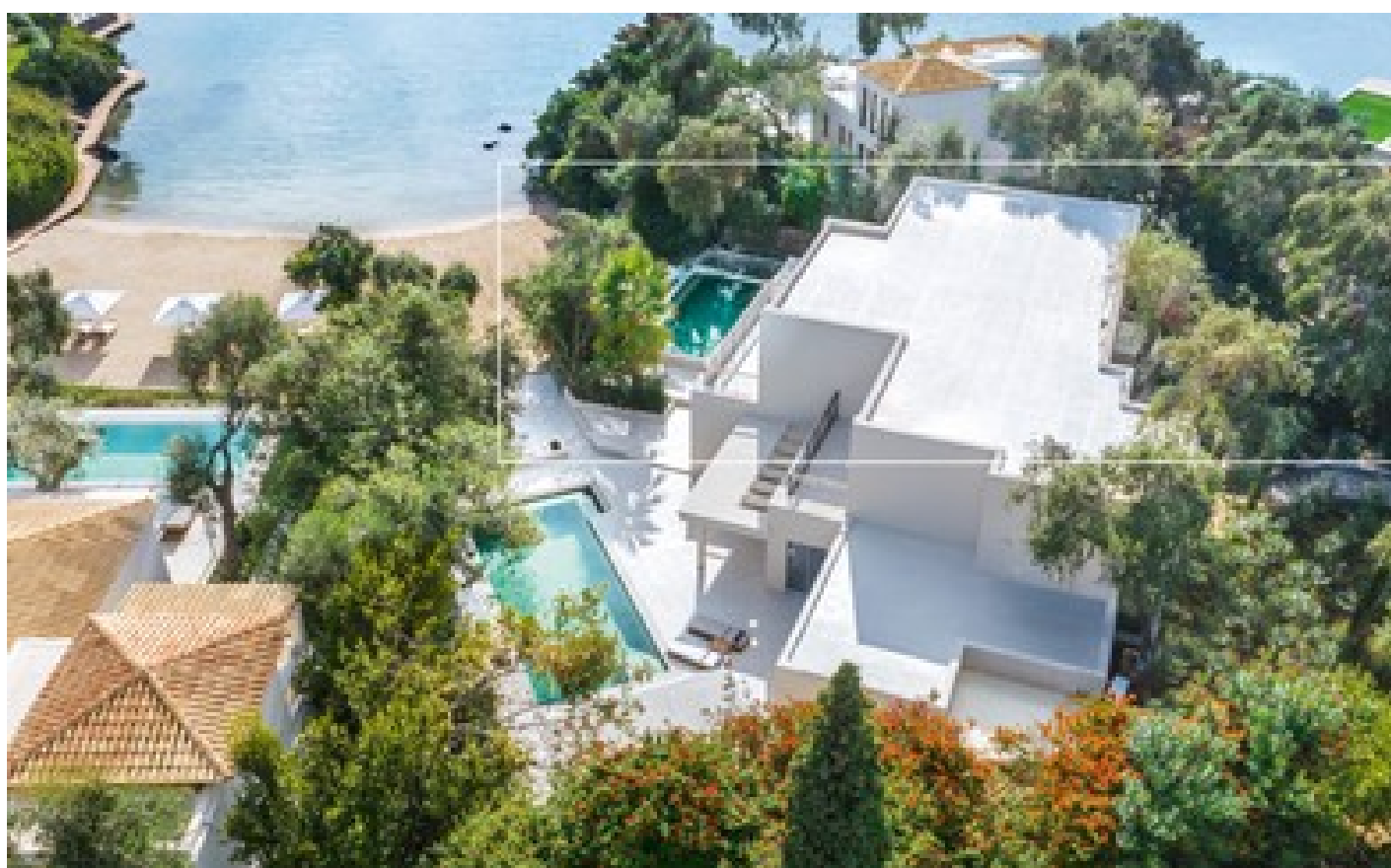
Royal Pavilion Private Pools, 6 Bedroom Direct Sea View