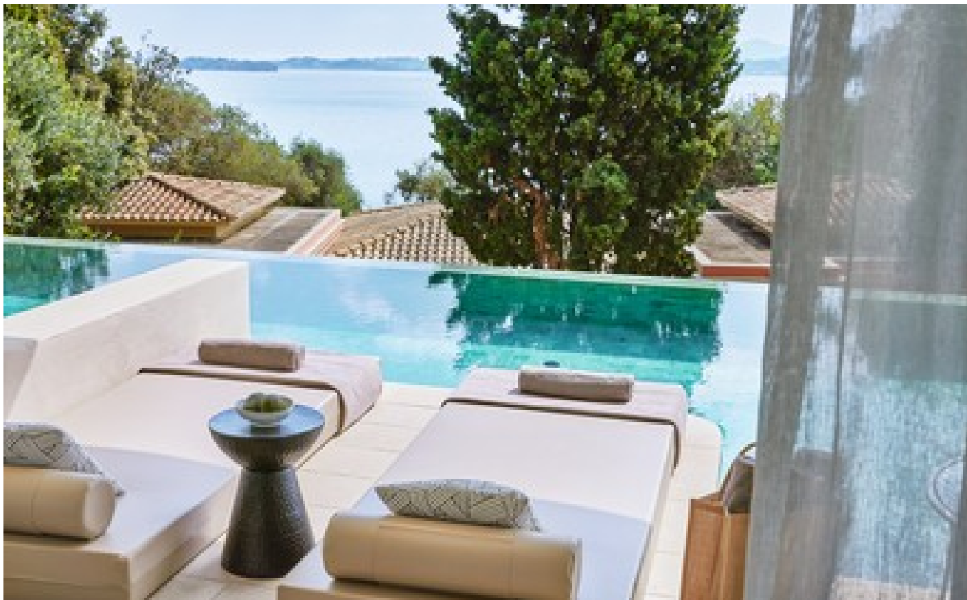
Family Bungalow Open Plan Sharing Pool Garden View