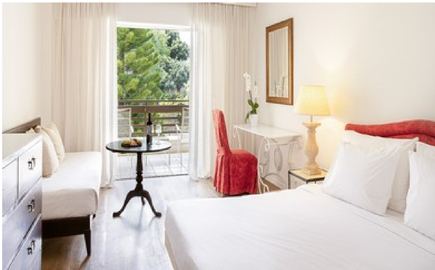
Grand Family Room (Family Apartment) Sea View