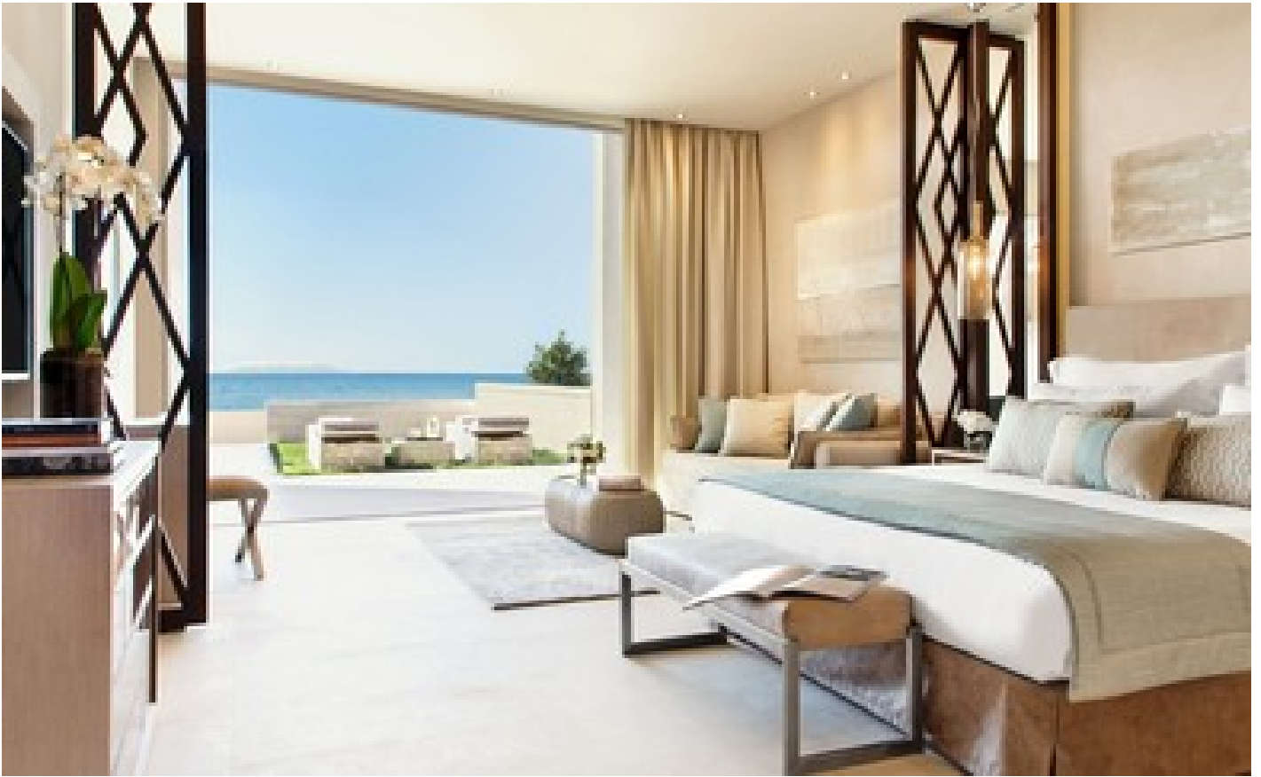
Deluxe Family Suite Private Garden Beach Front Sea View