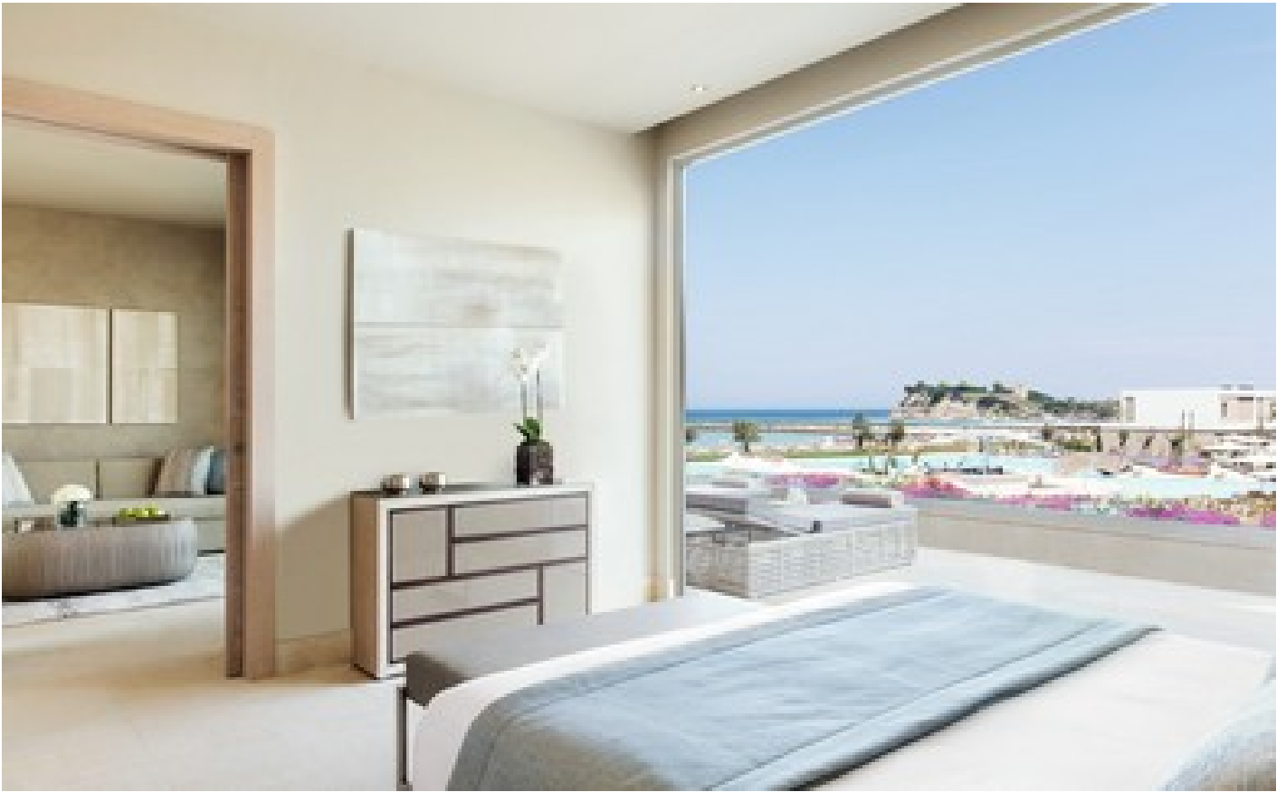
Deluxe One Bedroom Suite Grand Balcony Beach Front Sea View