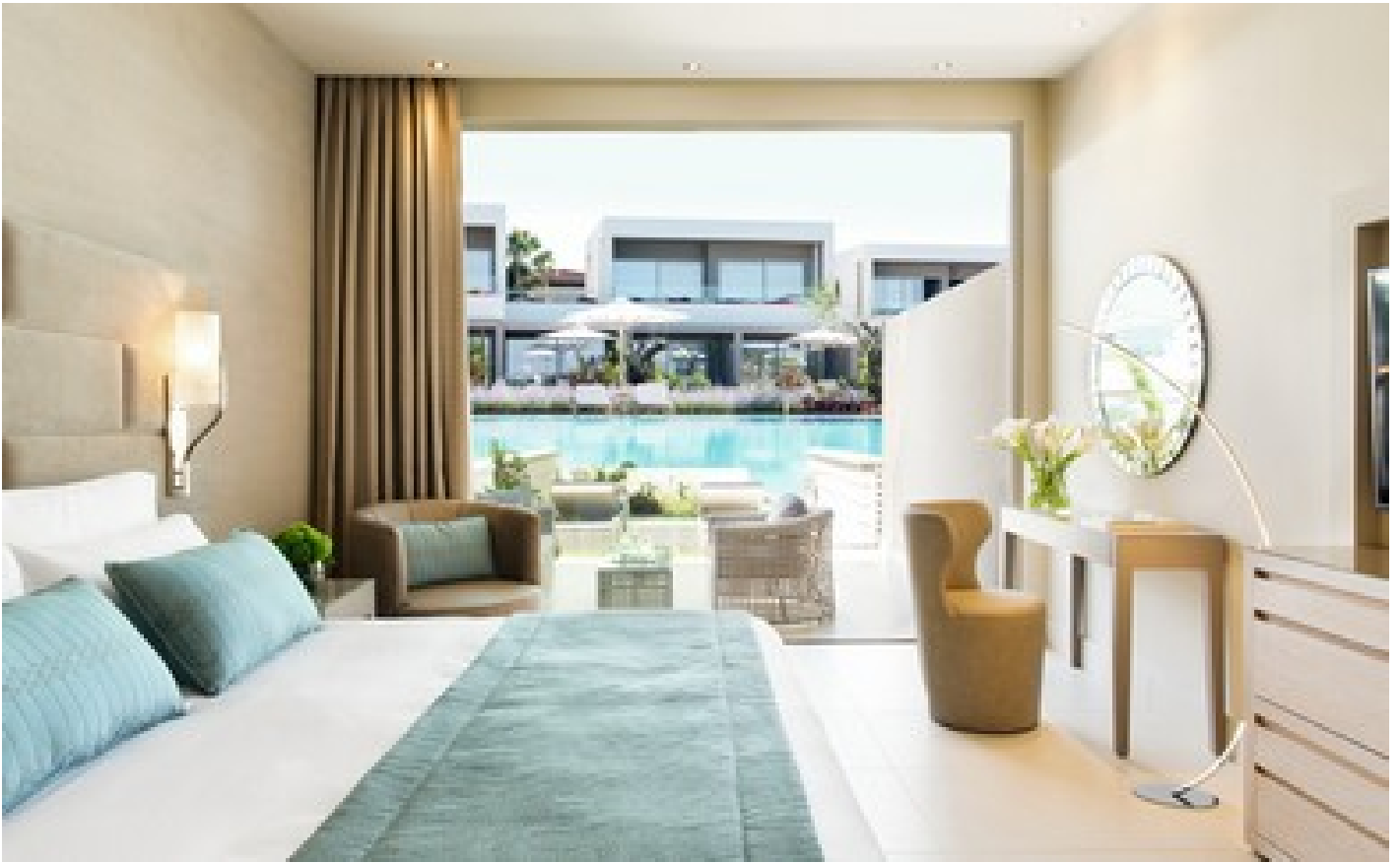
Family Room Private Garden Pool View