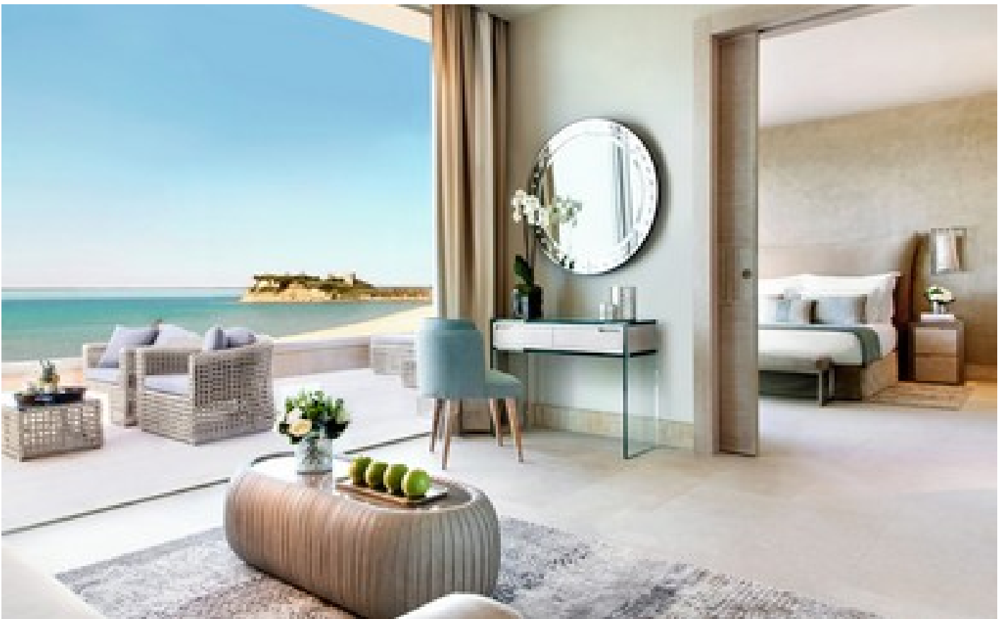
Deluxe Junior Suite Private Garden Beach Front Sea View