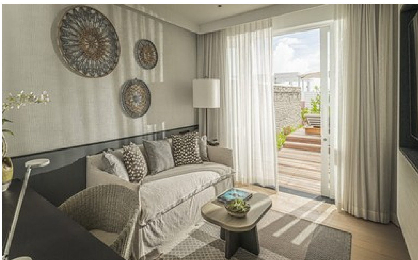
Two-Bedroom Oceanfront Bungalow - Partial Sea View