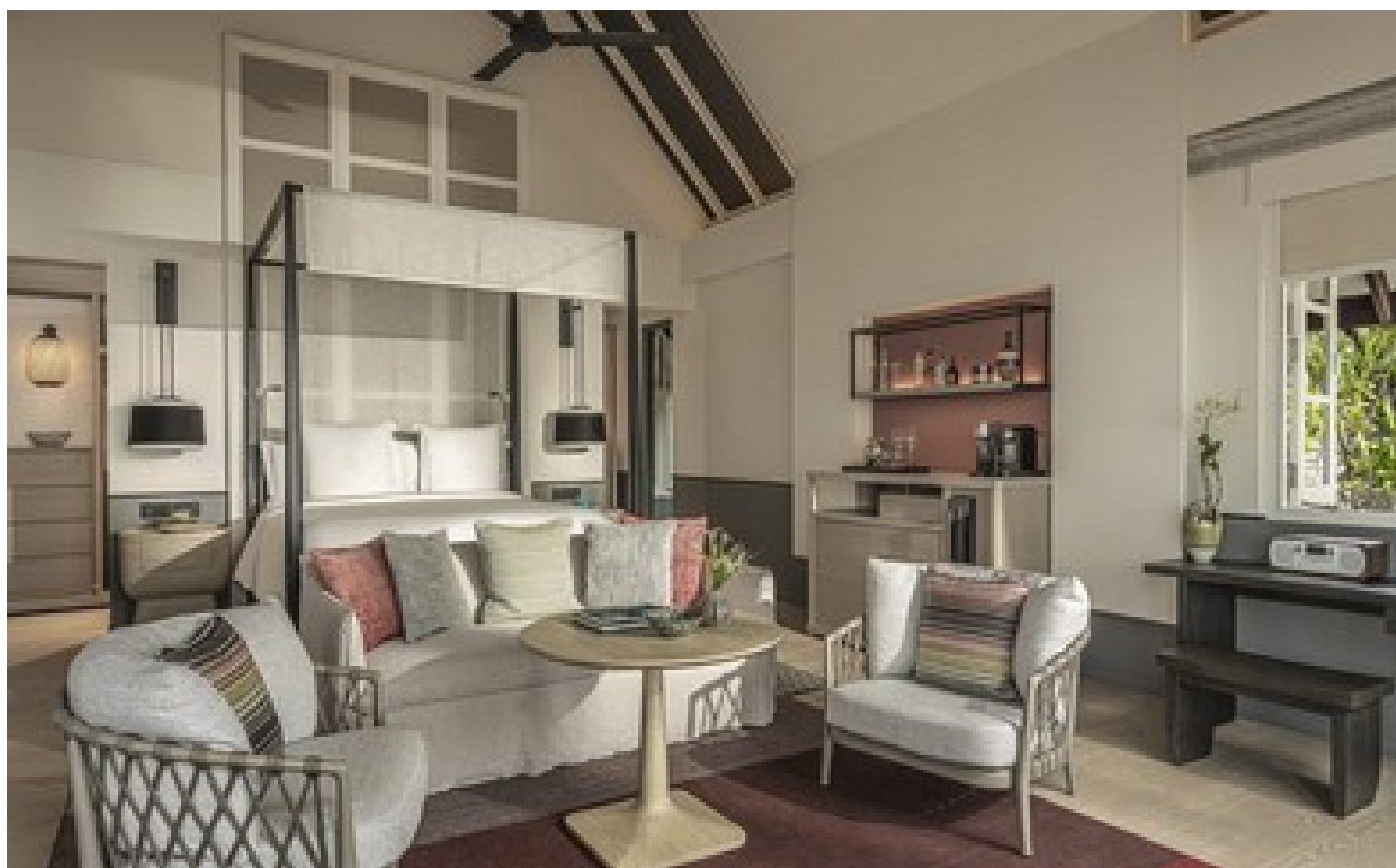
Family oceanfront bungalow with pool