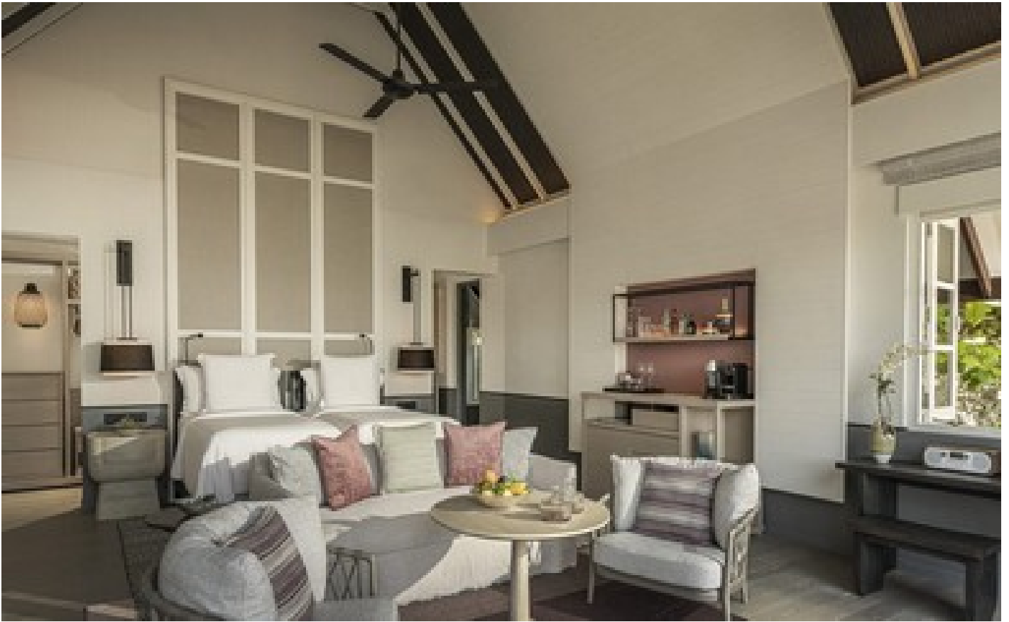
Two-bedroom oceanfront villa