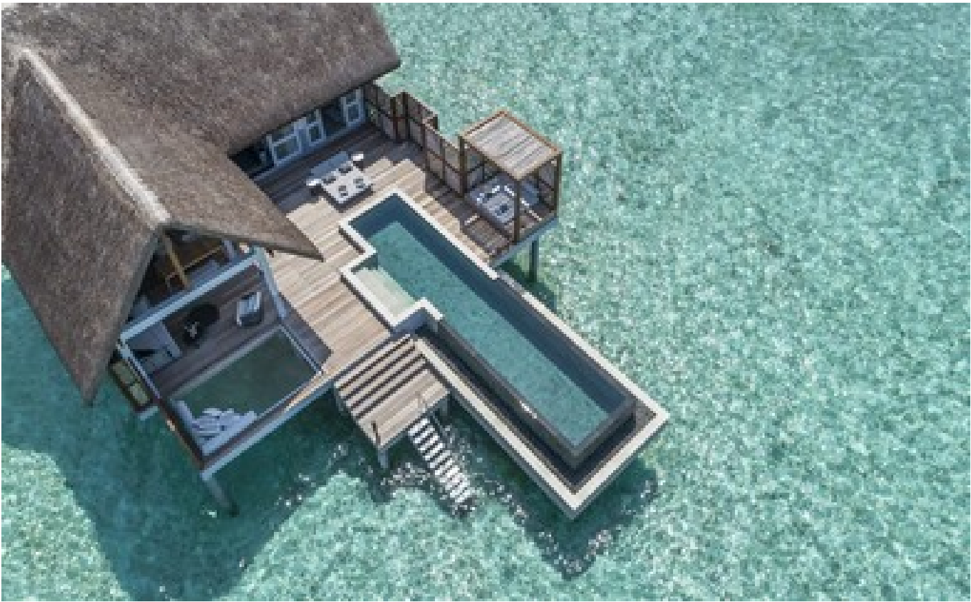
Sunset Family Water Villa with Pool