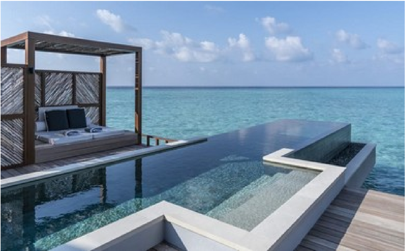
Water Villa with Pool - Partial Sea View