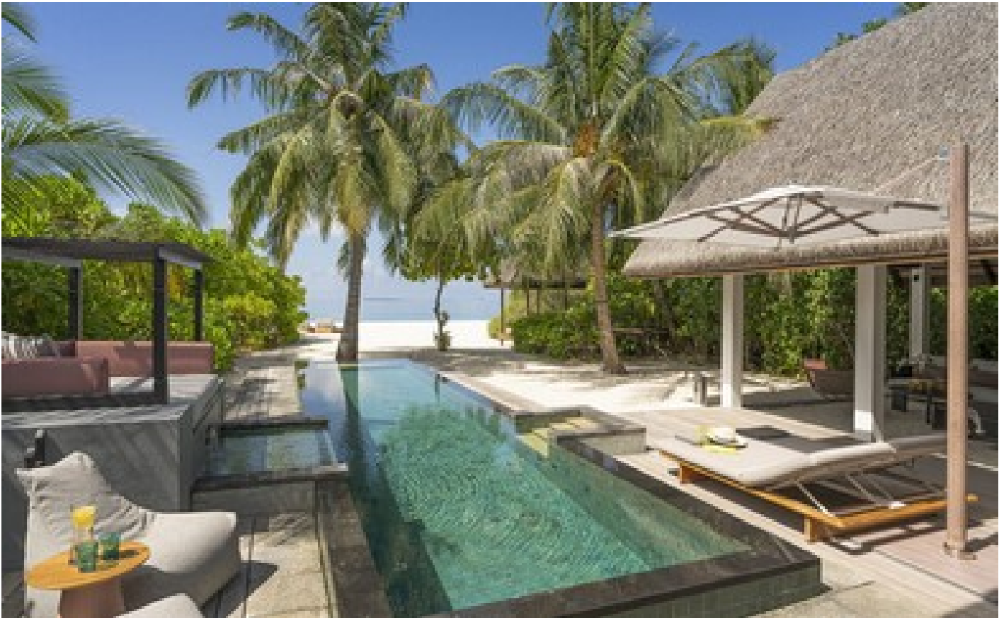
Family Beach Villa with Pool