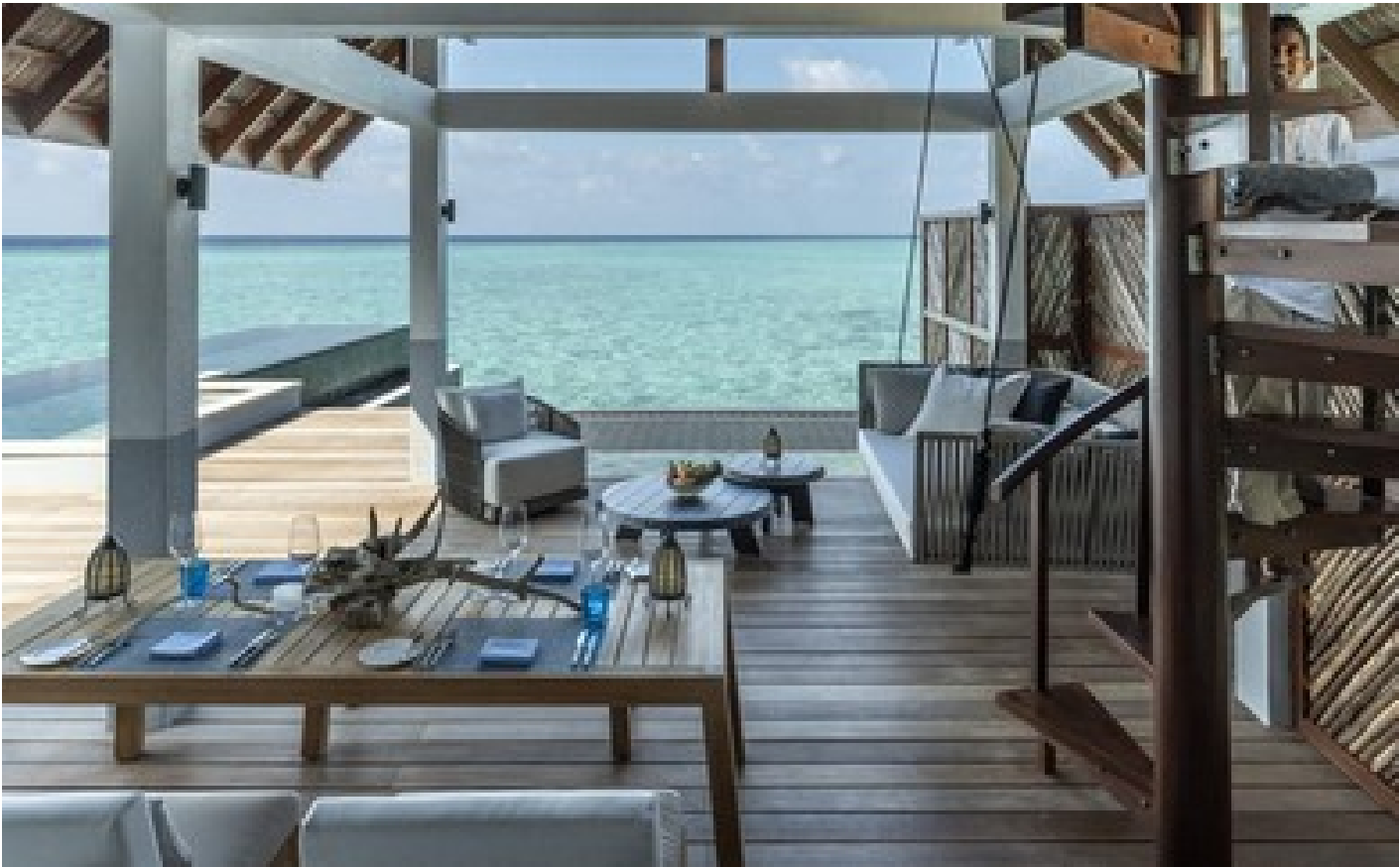
Sunrise Family Water Villa with Pool