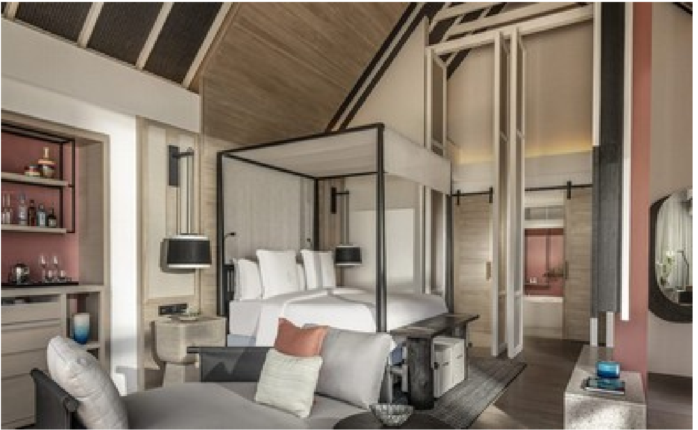
Beach Villa with Pool