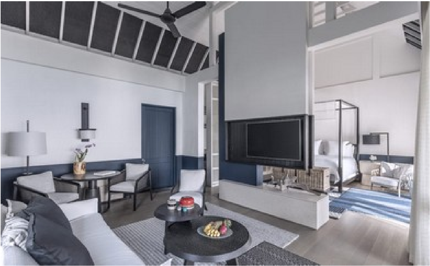
Premier Oceanfront Bungalow with Pool