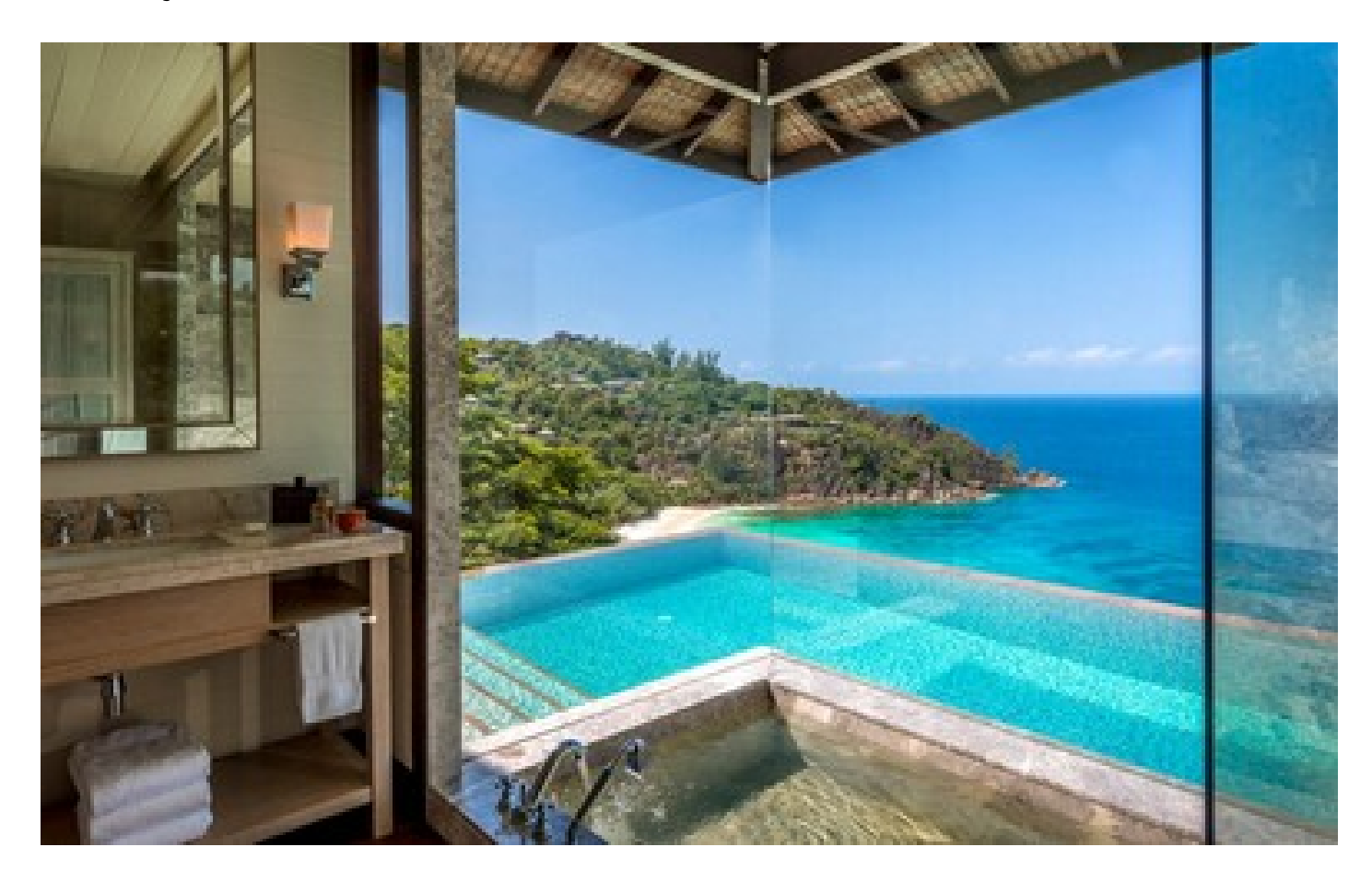
Hilltop Ocean-View Villa