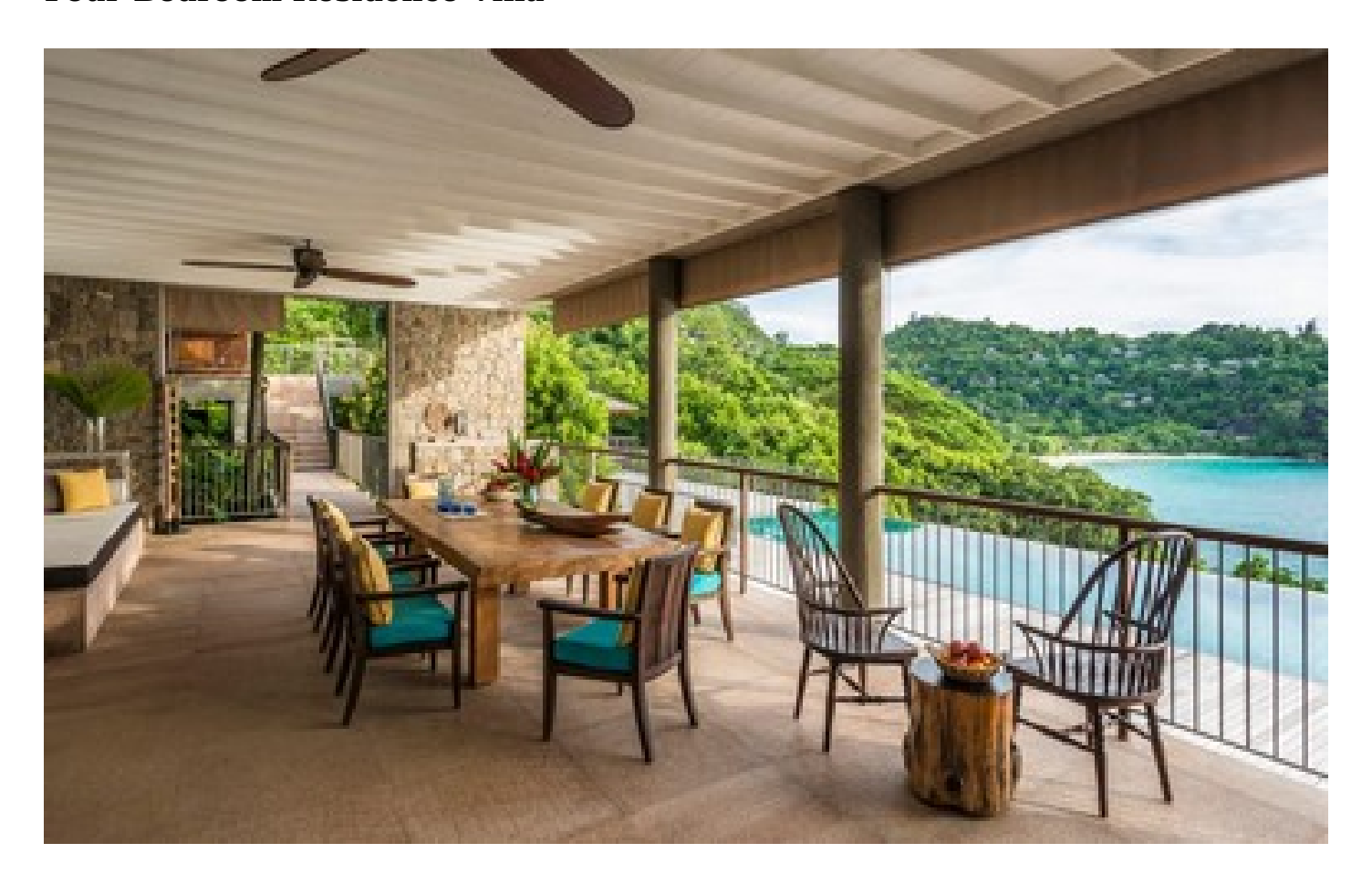
Three-Bedroom Residence Villa