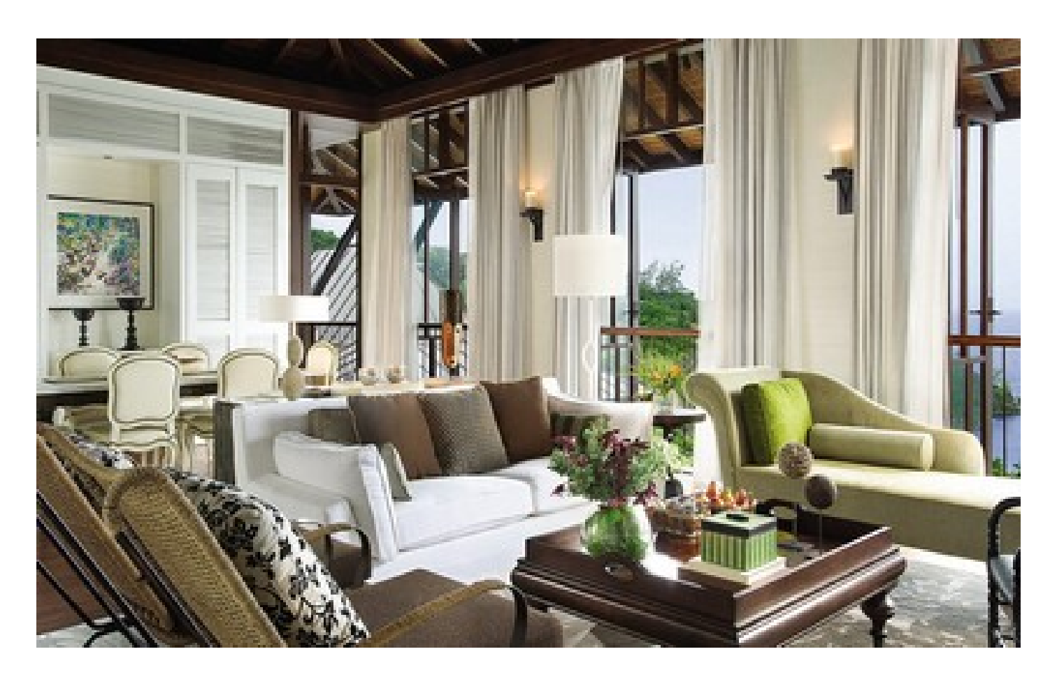
Three-Bedroom Royal Suite