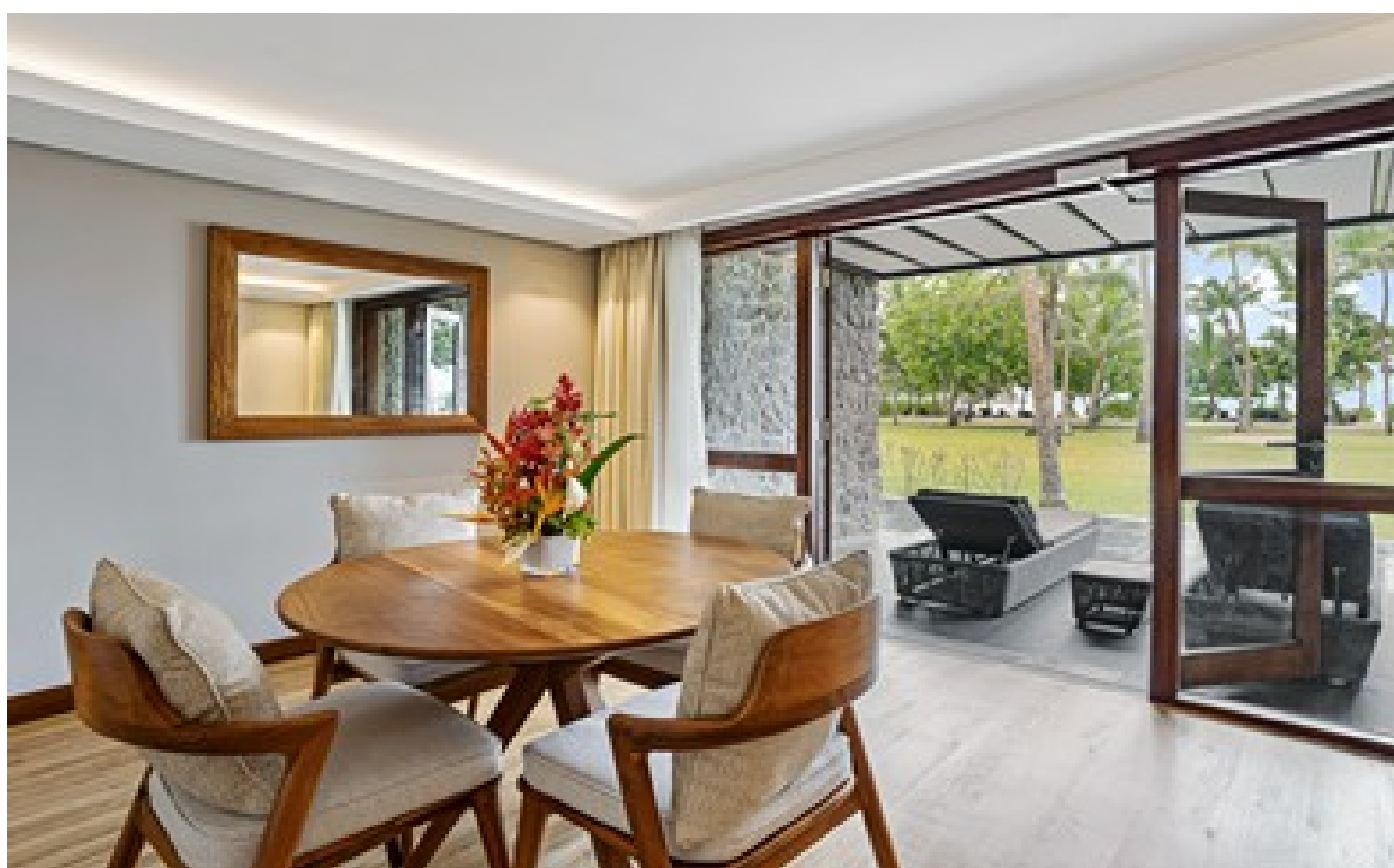
The Picault Suite