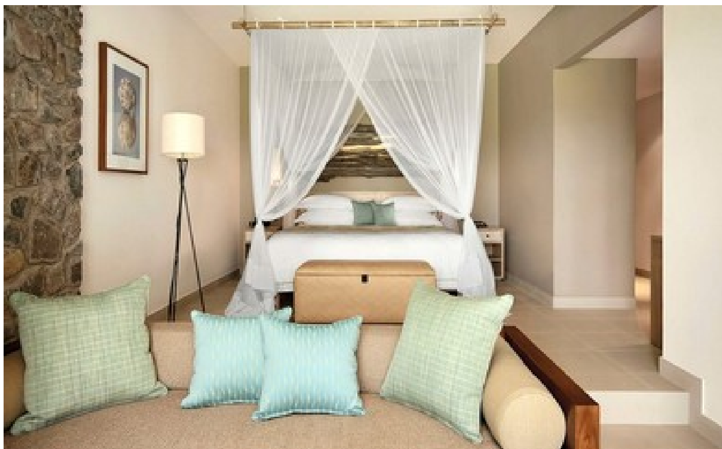
The Plantation Suite