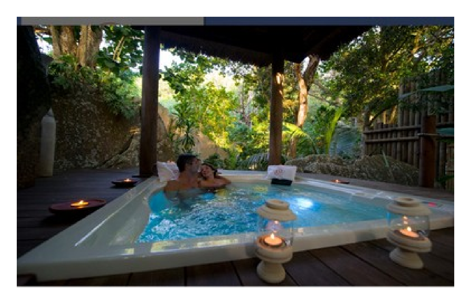
Villa de Charme