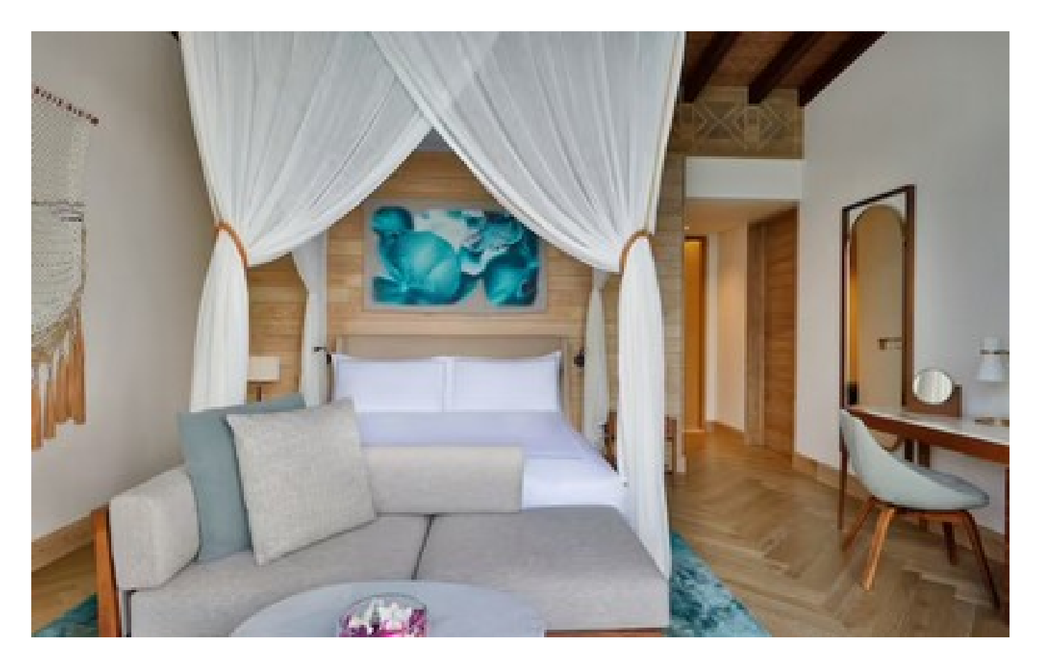
Three Bedroom Bay House With Plunge Pool