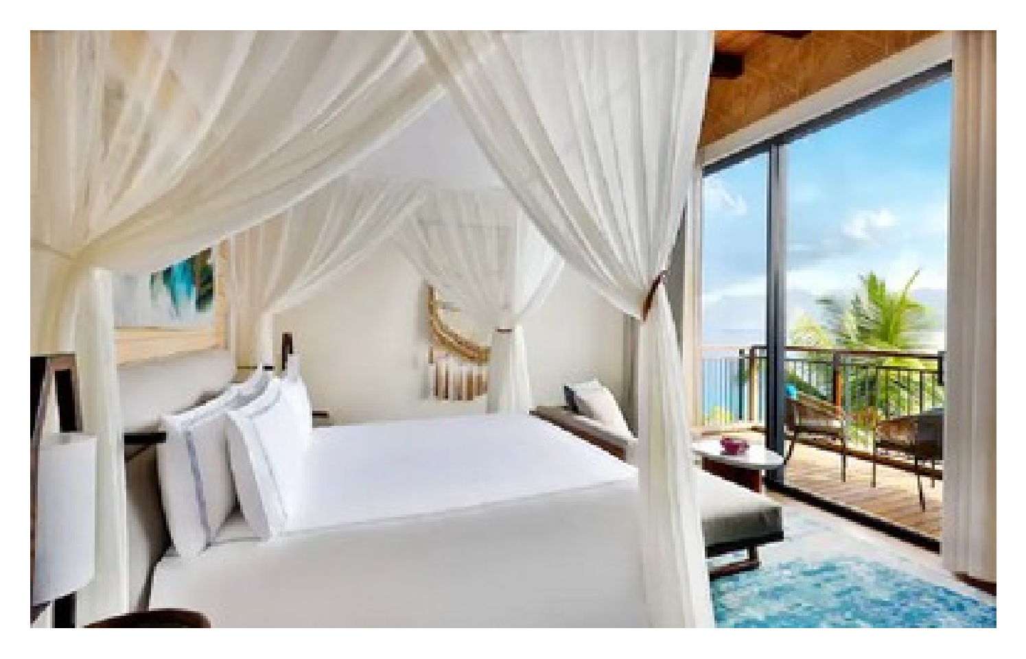
Twin Bed Premium Room With Ocean View