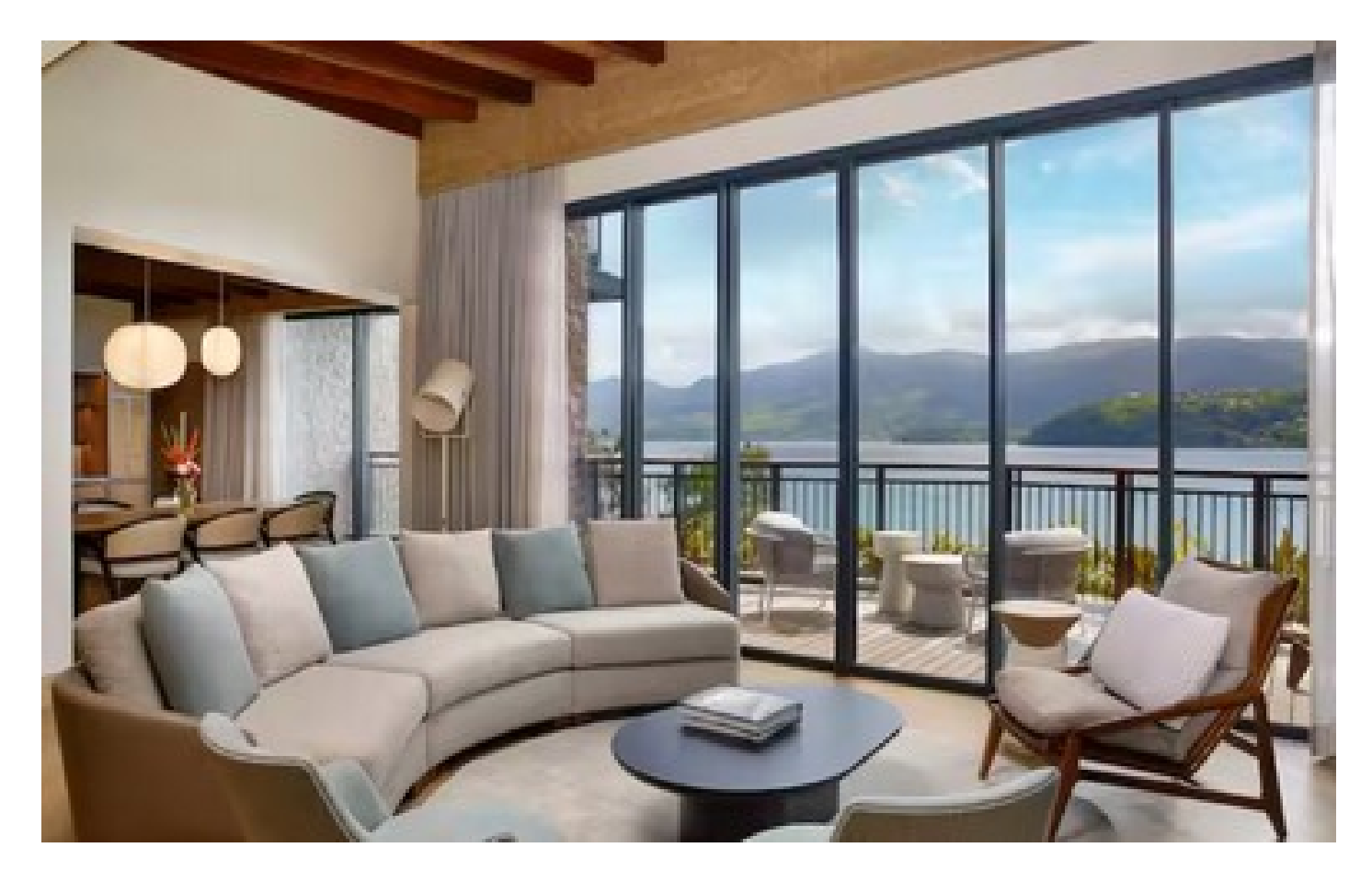
One Bedroom Bay House Suite With Plunge Pool