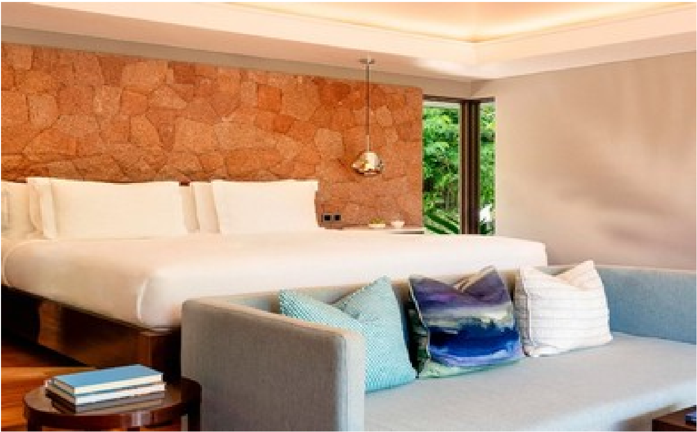
Ocean View Pool Villa - King