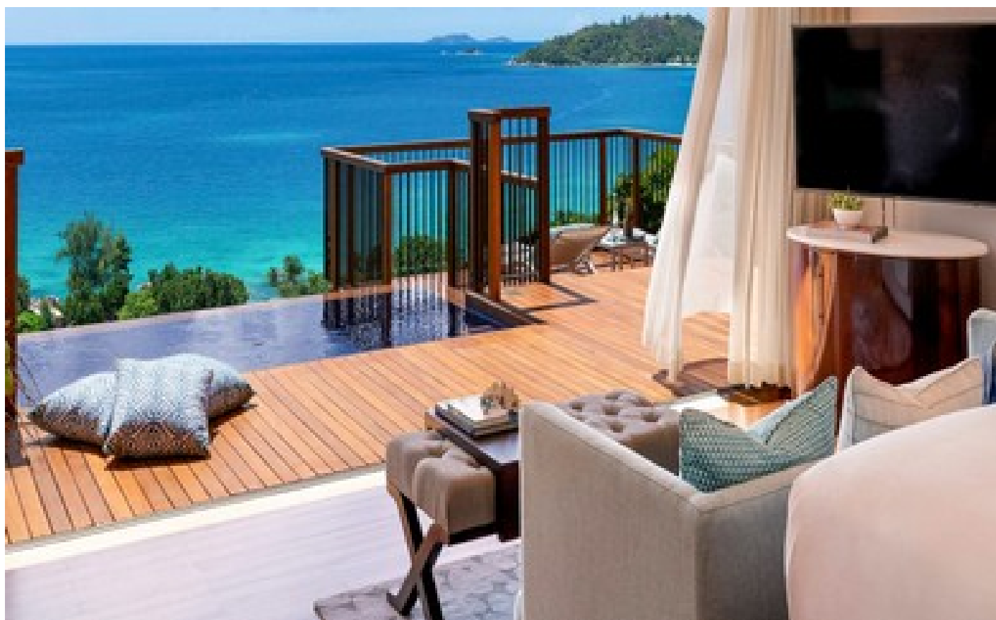
Panoramic Pool Villa - Twin