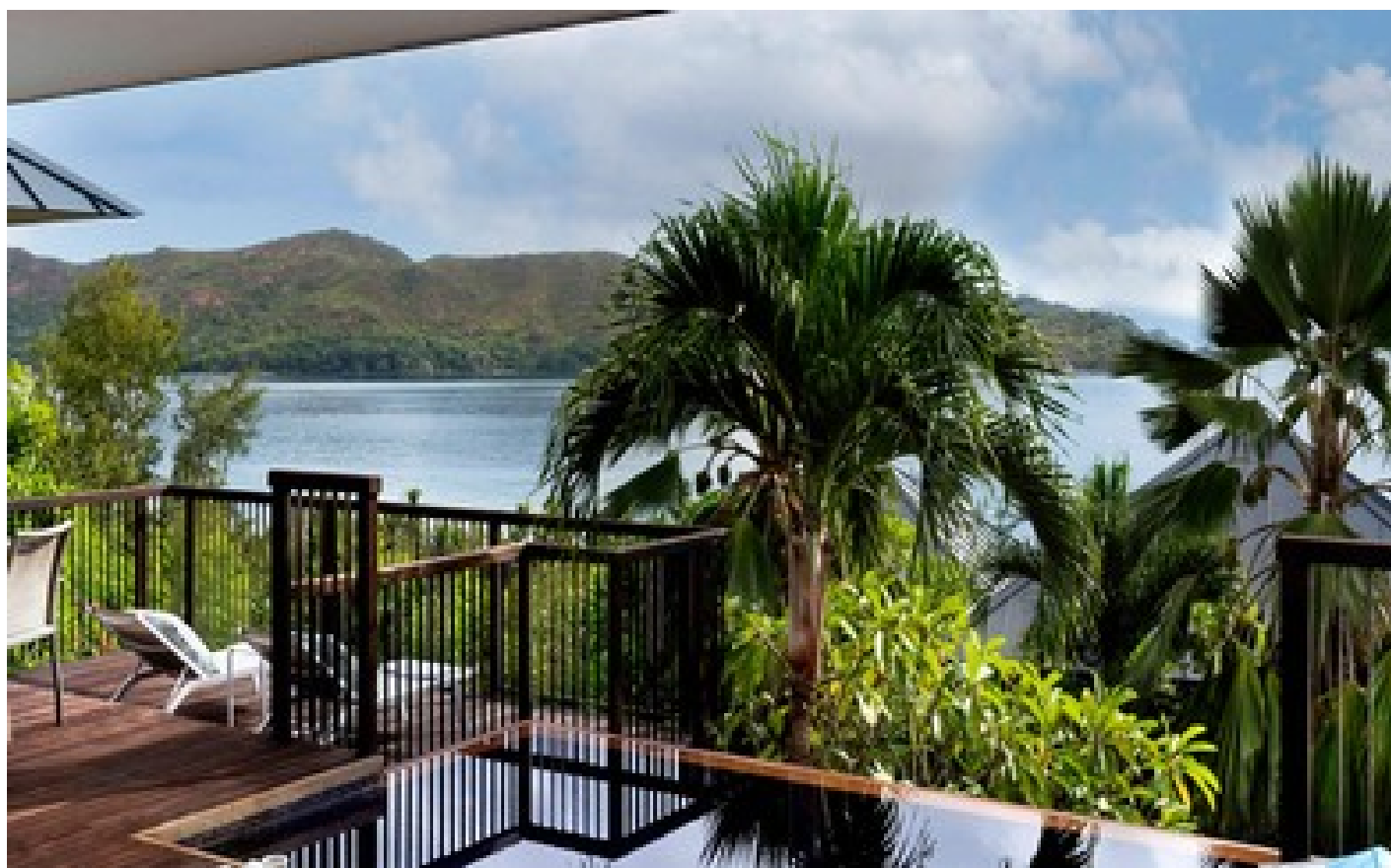
Grand Panoramic Pool Villa