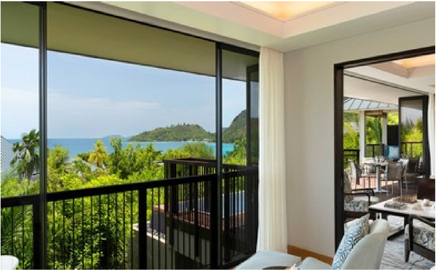
2 Bedroom Beachfront Pool Villa