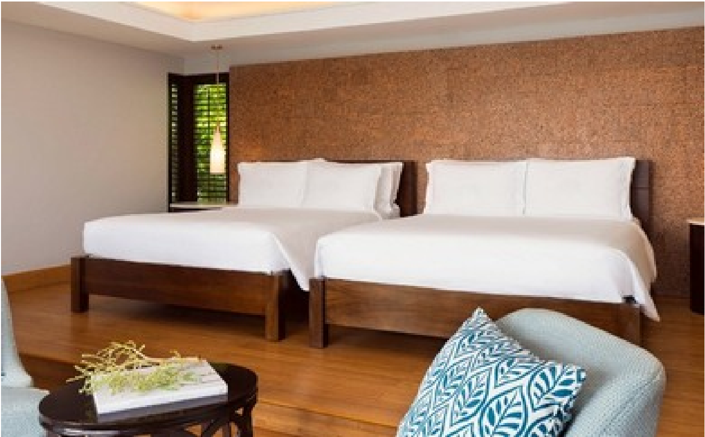
Hillside Pool Villa - King