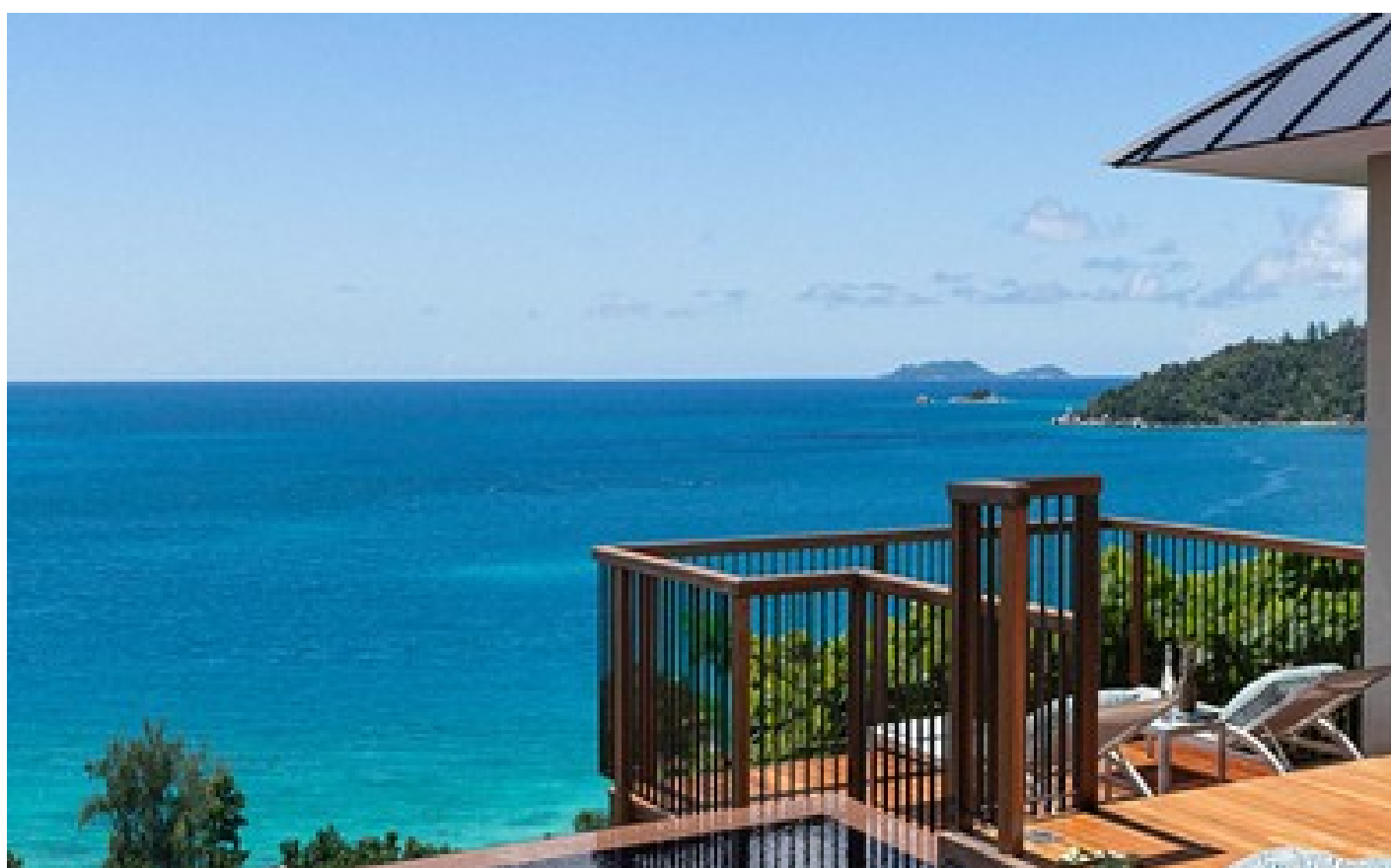
Grand Hillside Pool Villa