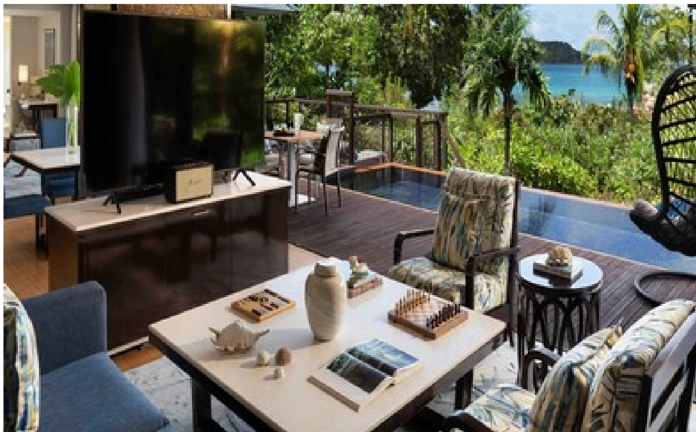
4 Bedroom Pool Residence