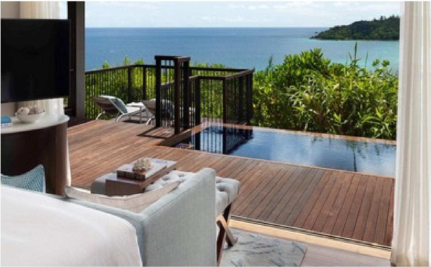
Panoramic Pool Villa - King